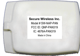
LABEL ADHESIVE DRAWING (REFERENCE ONLY)