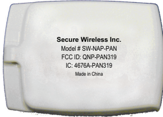
PAD PRINTING DRAWING (REFERENCE ONLY)