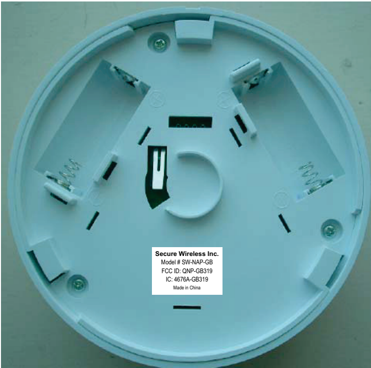
LABEL ADHESIVE DRAWING (REFERENCE ONLY)