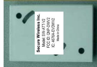
LABEL ADHESIVE DRAWING (REFERENCE ONLY)