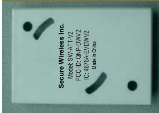
PAD PRINTING DRAWING (REFERENCE ONLY)