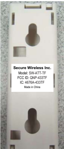
LABEL ADHESIVE DRAWING (REFERENCE ONLY)