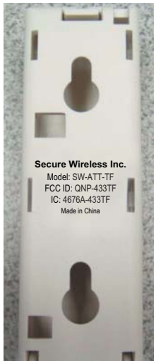
PAD PRINTING DRAWING (REFERENCE ONLY)