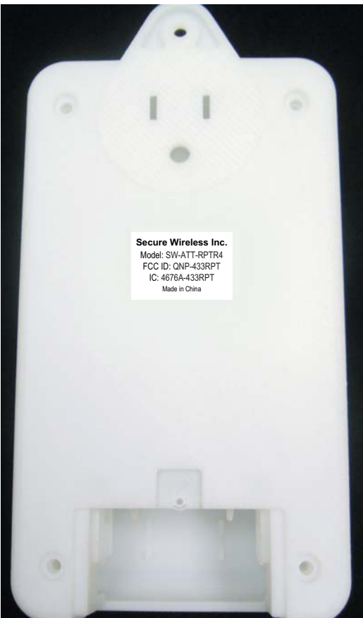
LABEL ADHESIVE DRAWING (REFERENCE ONLY)