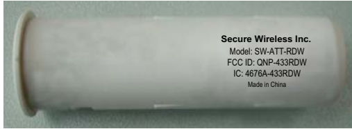
PAD PRINTING DRAWING (REFERENCE ONLY)