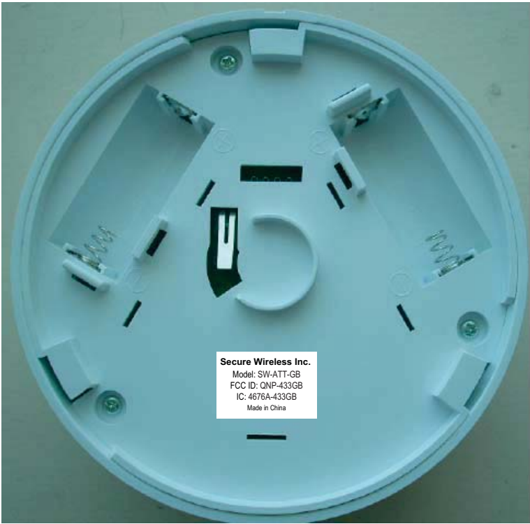
LABEL ADHESIVE DRAWING (REFERENCE ONLY)