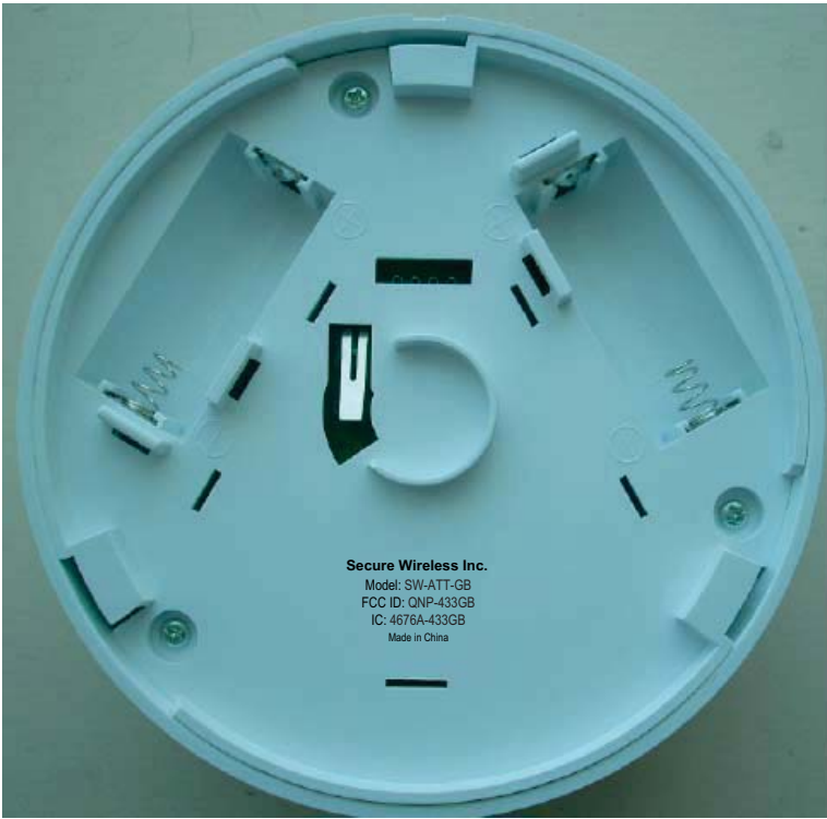
PAD PRINTING DRAWING (REFERENCE ONLY)