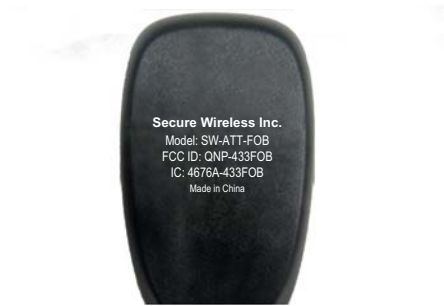
PAD PRINTING DRAWING (REFERENCE ONLY)