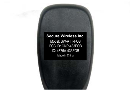
LABEL ADHESIVE DRAWING (REFERENCE ONLY)