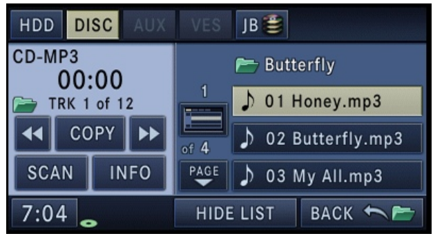
4. Touch the BACK soft-key to close a folder.

3. Touch a soft-key with a folder symbol to open a folder.