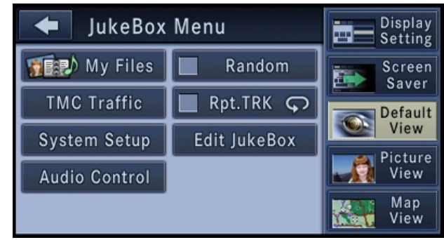
3. Touch the Edit Jukebox soft-key.