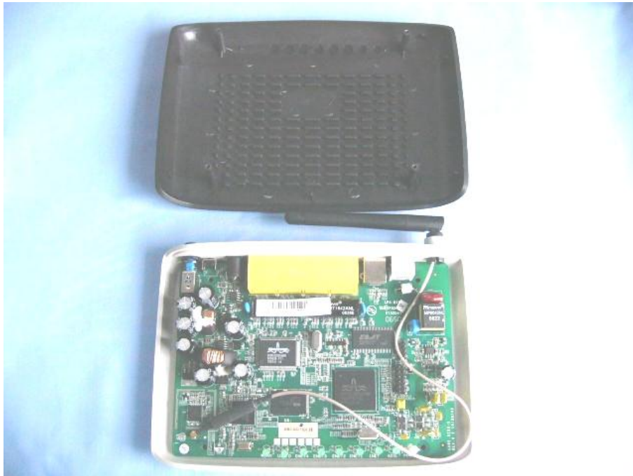
Main & RF board component side