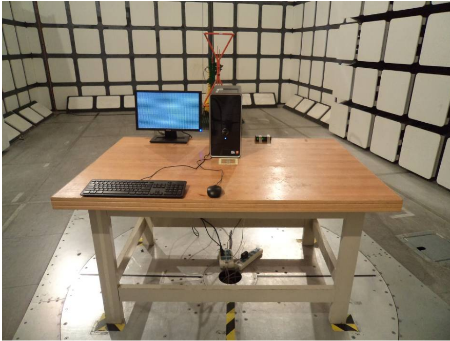
Radiated Emissions – Rear View (30~1000 MHz)