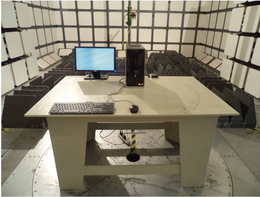
Radiated Emissions – Rear View (Above 1 GHz)