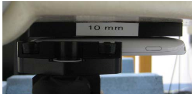
Photo of the device positioned for WR mode measurement – back facing phantom. The spacer was removed before the start of the measurements.