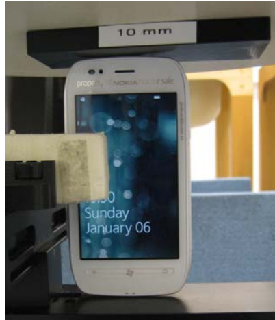
Photo of the device positioned for WR mode measurement – top edge facing phantom. The spacer was removed before the start of the measurements.