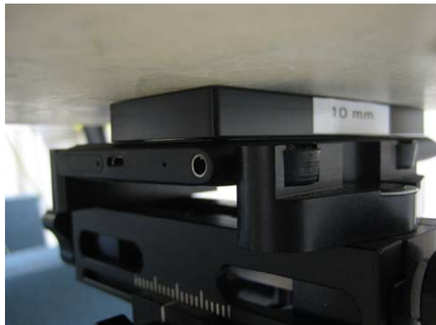
Photo of the device positioned for WR mode measurement – display facing phantom. The spacer was removed before the start of the measurements.

The device was placed in the SPEAG holder using the Nokia spacer and, in sequence, the display, back and each of the 4 edges was positioned 10.0mm away from the flat phantom. The spacer was removed before the start of the measurements.