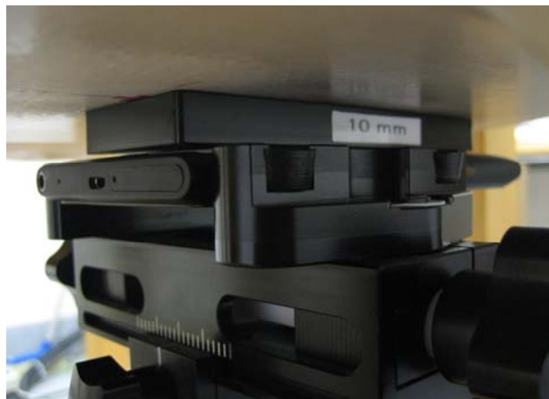
Photo of the device positioned for WR mode measurement – back facing phantom. The spacer was removed before the start of the measurements.