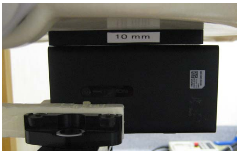
Photo of the device positioned for WR mode measurement – left edge facing phantom. The spacer was removed before the start of the measurements.