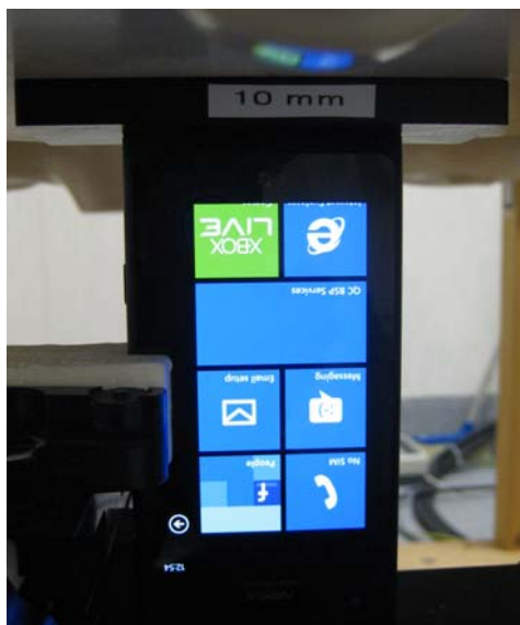
Photo of the device positioned for WR mode measurement – bottom edge facing phantom. The spacer was removed before the start of the measurements.