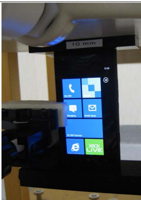
Photo of the device positioned for WR mode measurement – top edge facing phantom. The spacer was removed before the start of the measurements.