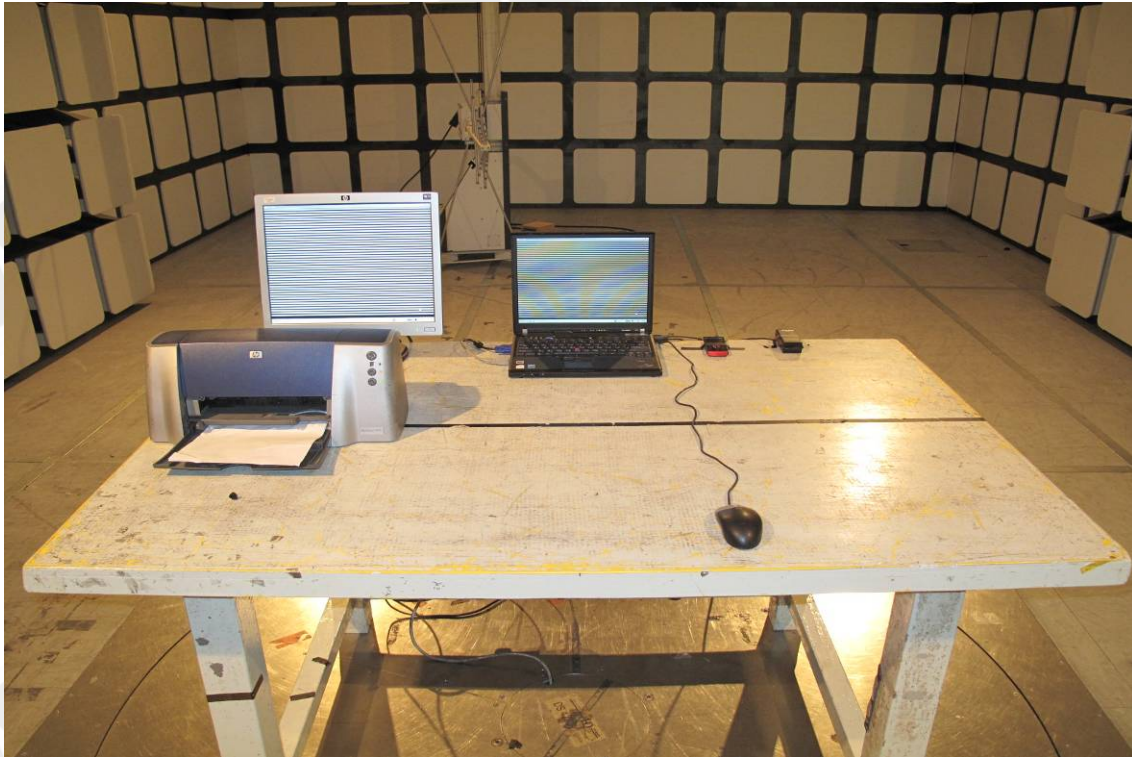
Radiated Emission Test Setup Photo