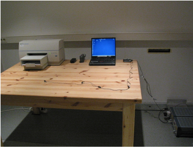
Picture 3 AC powerline conducted emission measurement 15B