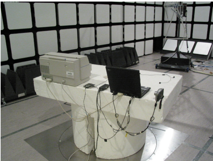
Picture 2 Radiated emission 15B