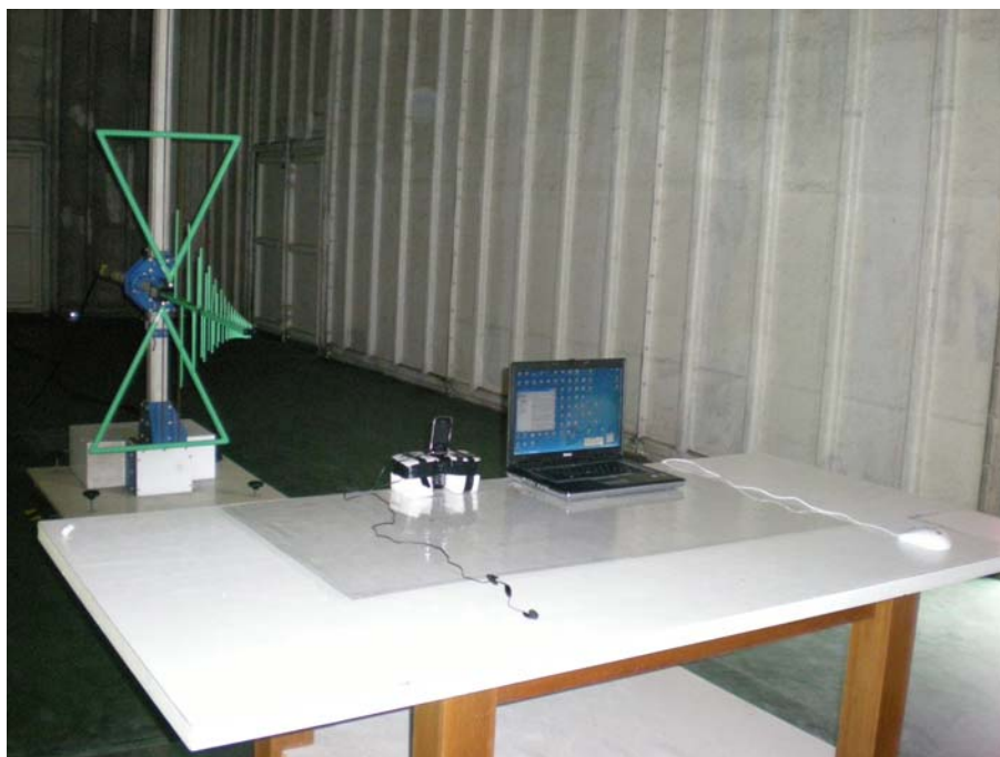
Back View of Radiated Test(30 ~ 1000MHz)