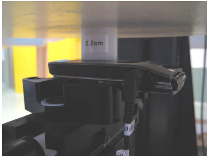
Photo of device positioned for Body SAR measurement. The spacer was removed for the tests.

The device was placed in the SPEAG holder using the Nokia spacer and placed below the flat section of the phantom. The distance between the device and the phantom was kept at the separation distance indicated in the photo below using a separate flat spacer that was removed before the start of the measurements. The device was oriented with its antenna facing the phantom since this orientation gives higher results.