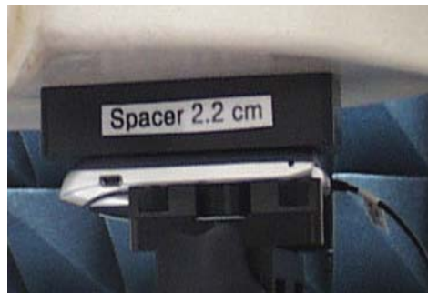
Photo of the device positioned for Body SAR measurement. The spacer was removed for the tests.

The device was placed in the SPEAG holder using the Nokia spacer and placed below the flat section of the phantom. The distance between the device and the phantom was kept at the separation distance indicated in the photo below using a separate flat spacer that was removed before the start of the measurements. The device was oriented with its antenna facing the phantom since this orientation gives higher results.