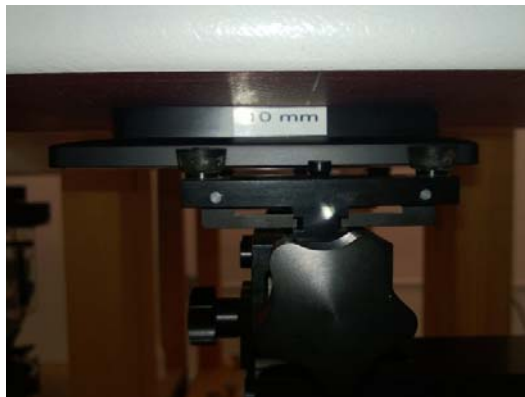
Photo of the device positioned for WR mode measurement –back facing phantom. The spacer was removed before the start of the measurements.

The device was placed in the SPEAG holder using the Nokia spacer and, in sequence, the back, display and each of the 4 edges was positioned 10.0mm away from the flat phantom. The spacer was removed before the start of the measurements.