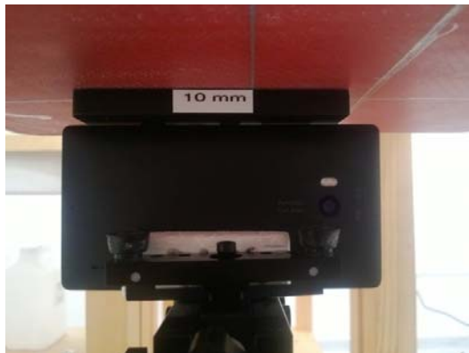
Photo of the device positioned for WR mode measurement – right edge facing phantom. The spacer was removed before the start of the measurements.