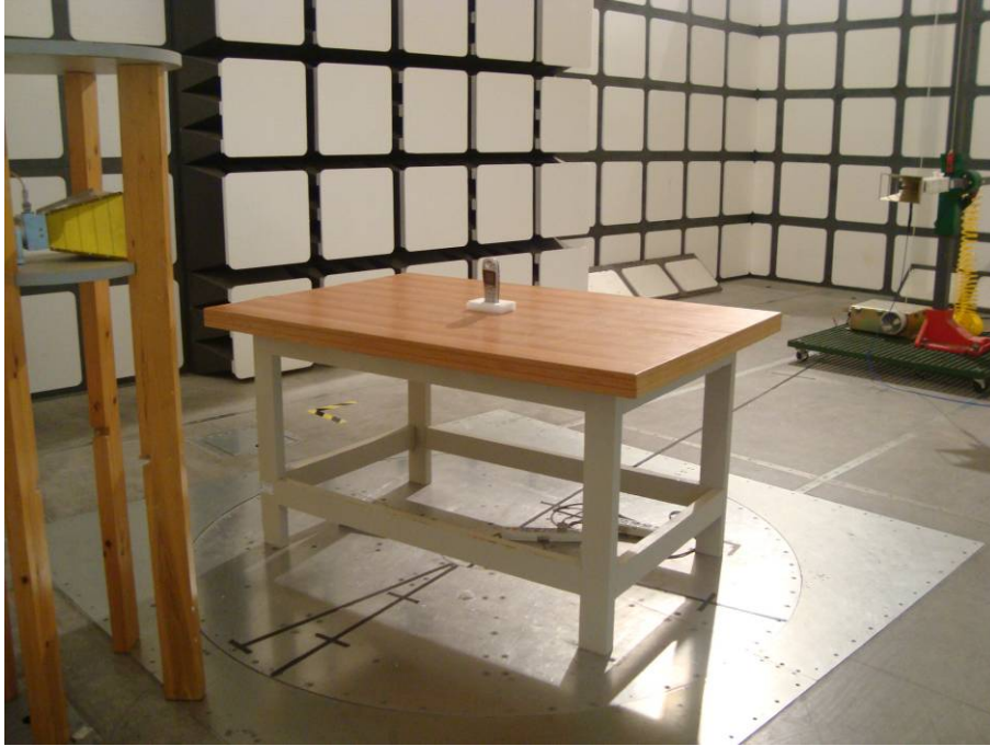
Spurious Emissions - Rear View (Above 1 GHz)