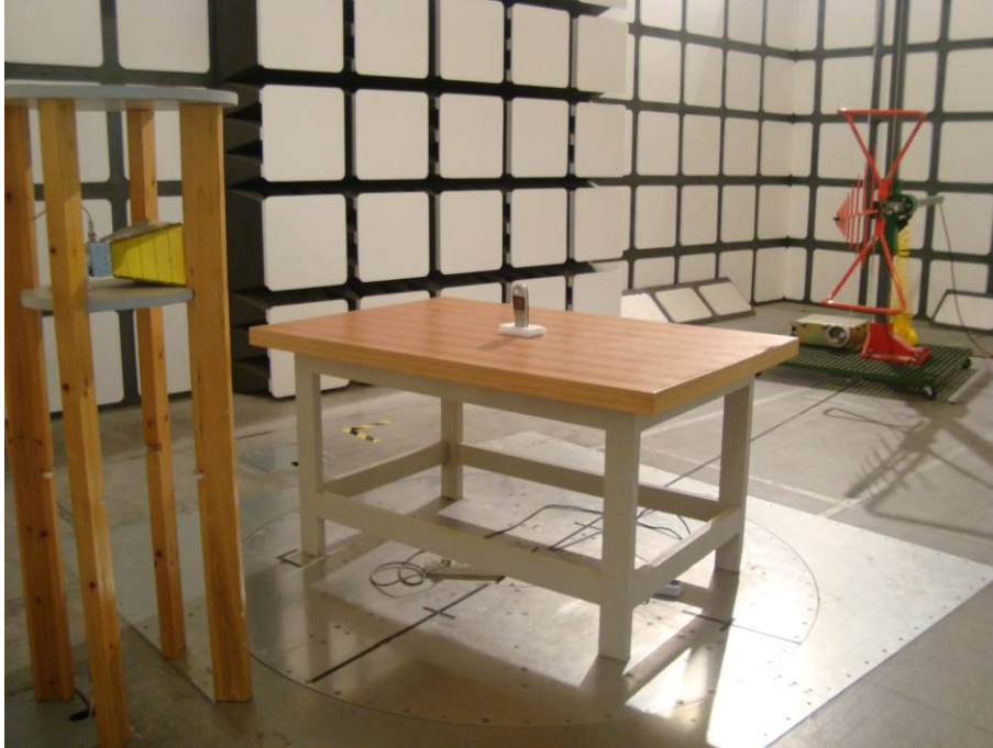
Radiated Emissions - Side View (30 MHz-1000MHz)