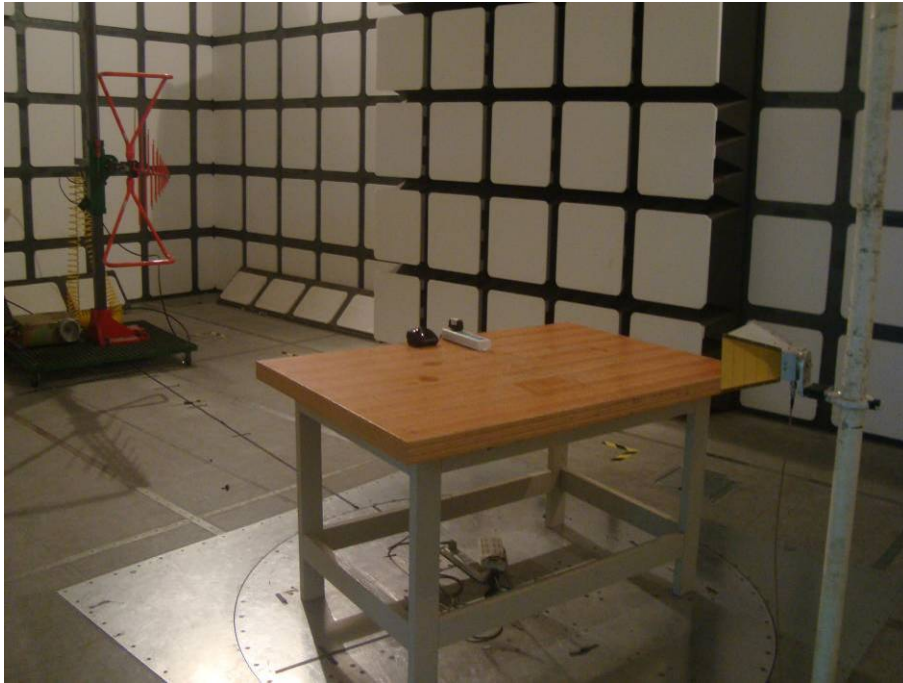
Transmitting: Radiated Emissions - Rear View (Below 1 GHz)