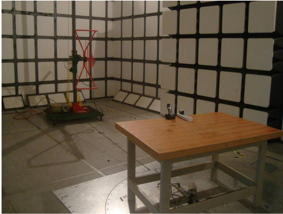
Charging: Radiated Emissions - Rear View (Below 1 GHz)