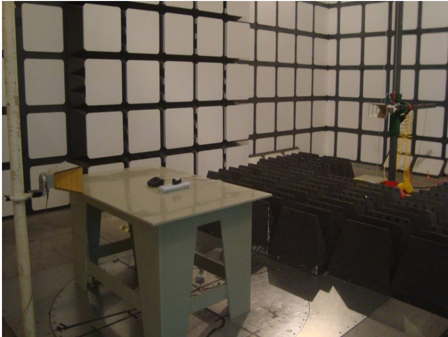
Transmitting: Radiated Emissions - Rear View (Above 1 GHz)