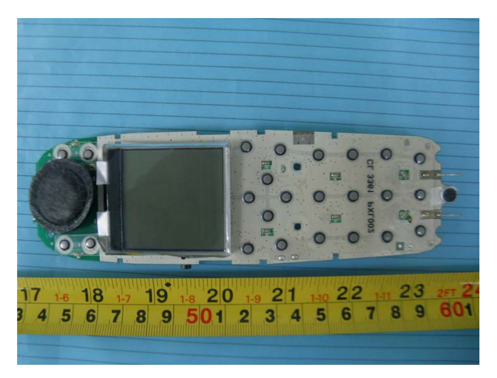
EUT- Main Board Components Top View