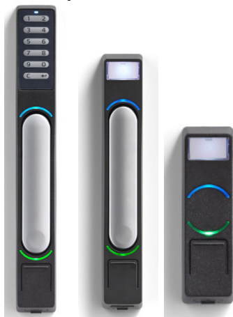
All LF and HF handles share the same RFID reader functionality.

In case the Handle has a Keypad, the user can enter a digit code to get access on a 12-digit keyboard located in the handle front side. However the keypad functionality is optional, it does not affect the RFID functionality. The status of the Handle is shown to the user by RGB LEDs.