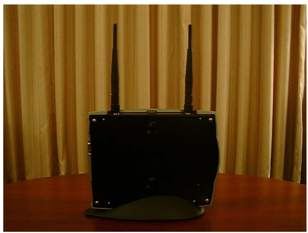
Figure 4 - Back with antennas