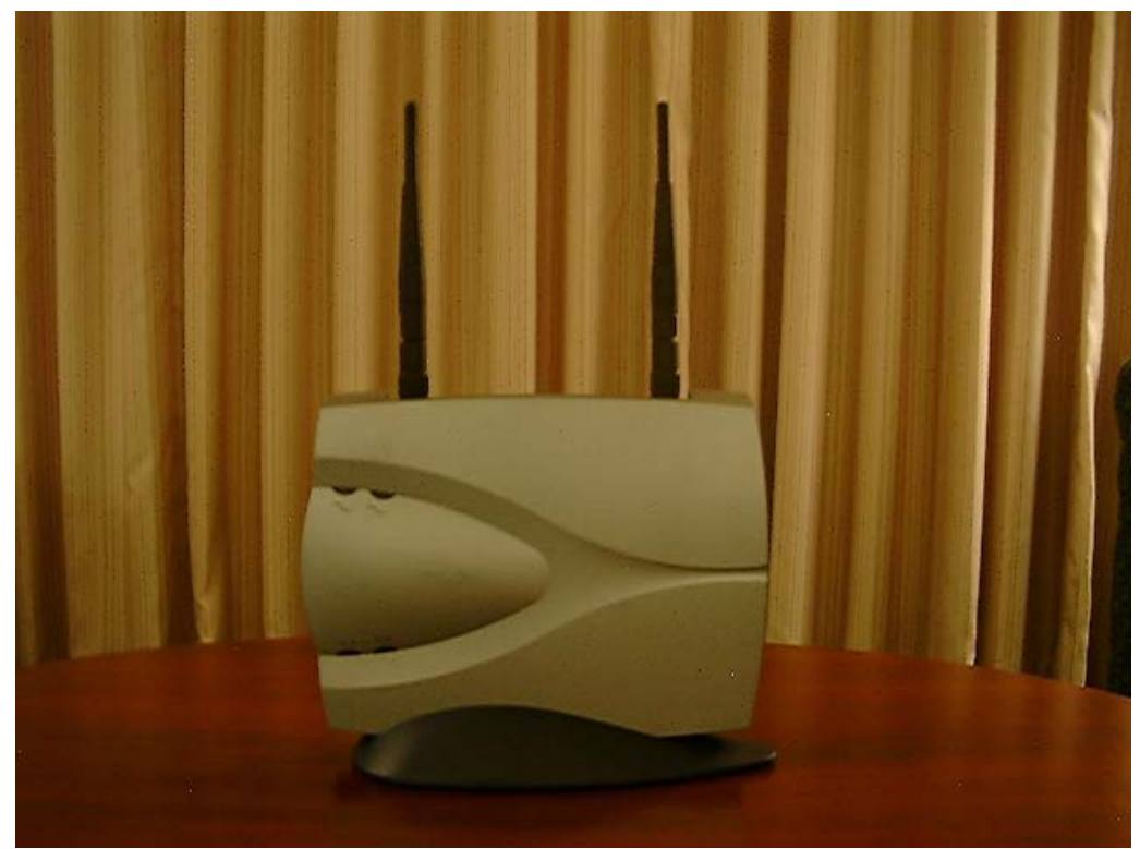
Figure 3 - Front with antennas