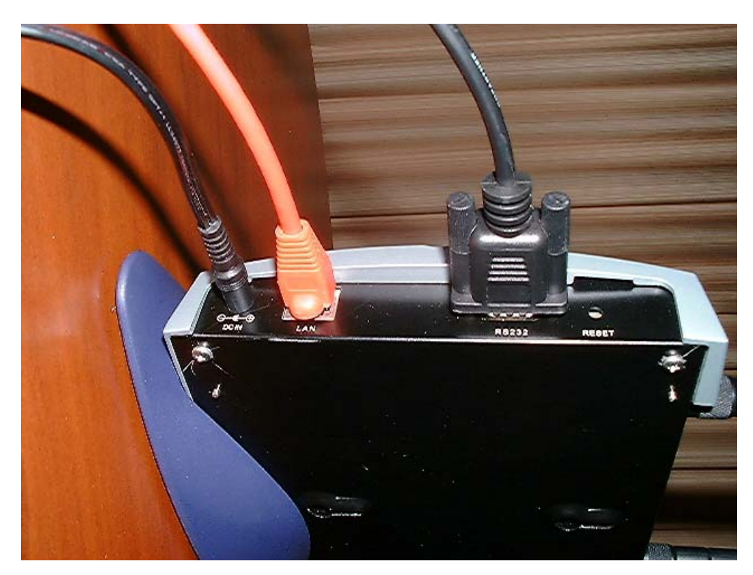
Figure 11 - I/O port s with cables attached