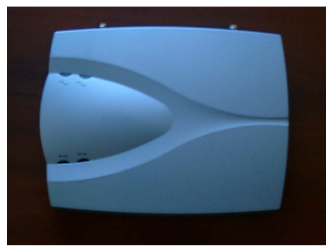
Figure 1 - Front