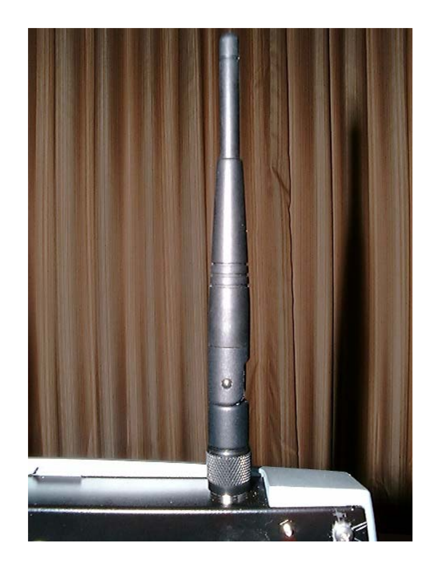
Figure 8 - Left Antenna