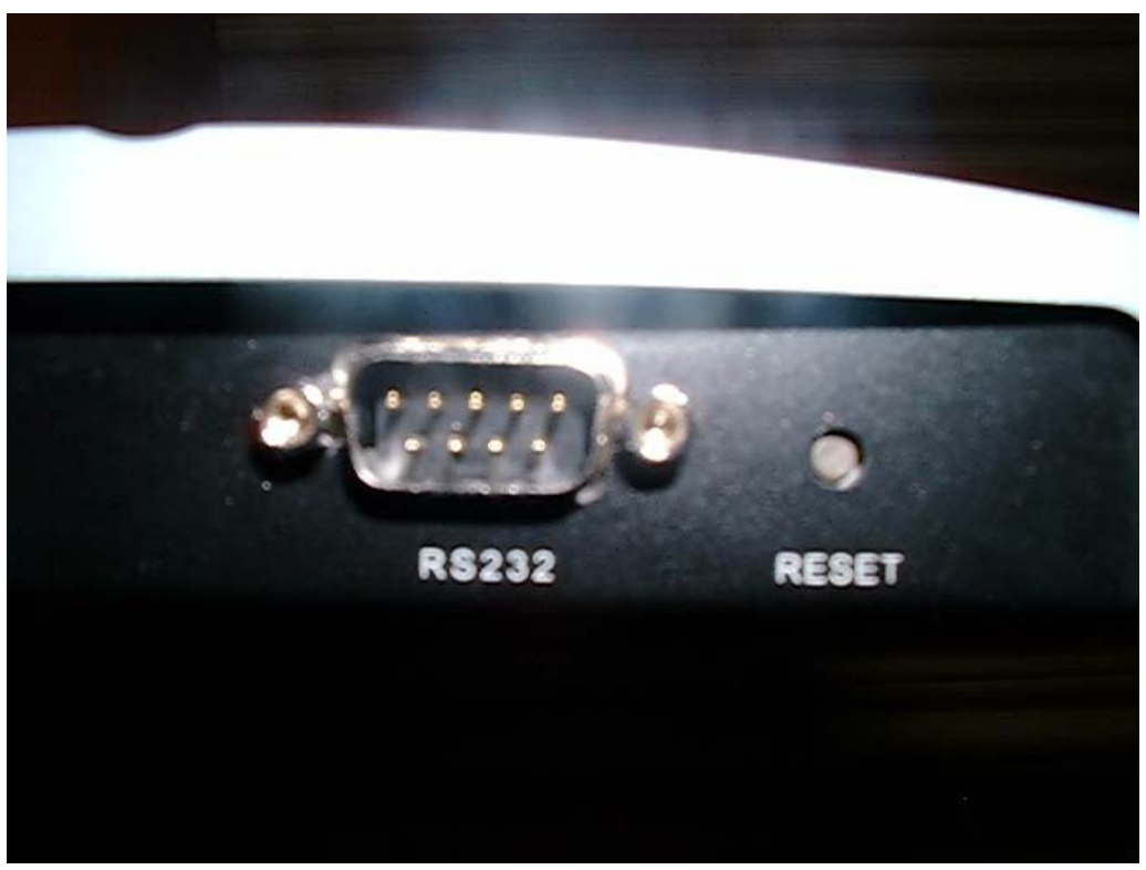
Figure 10 - RS232 & RESET