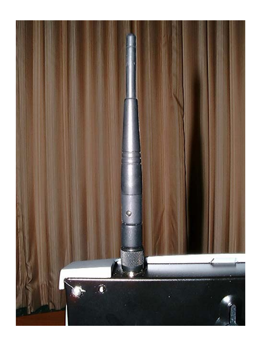
Figure 7 - Right Antenna