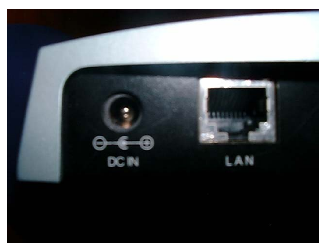
Figure 9 - Power & LAN