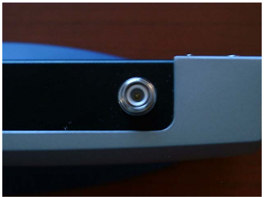
Figure 5 - Right Antenna port