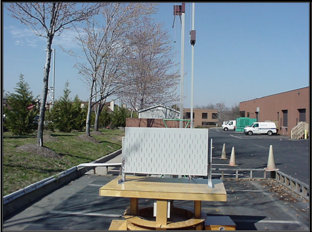
PHOTOGRAPH 3: RADIATED EMISSIONS FRONT VIEW WORST CASE CONFIGURATION