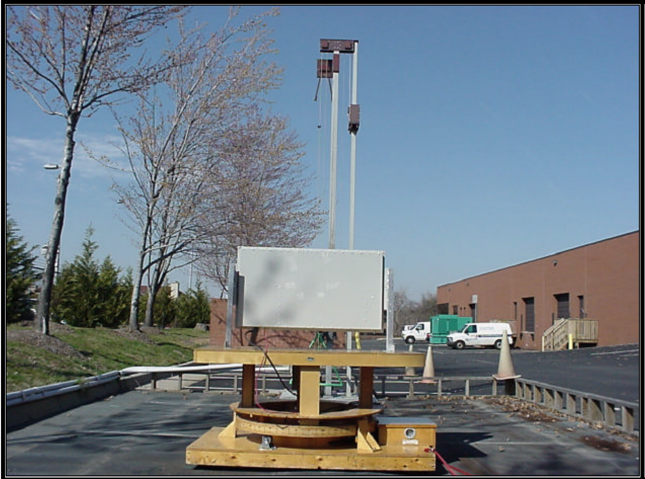
PHOTOGRAPH 4: RADIATED EMISSIONS REAR VIEW WORST CASE CONFIGURATION