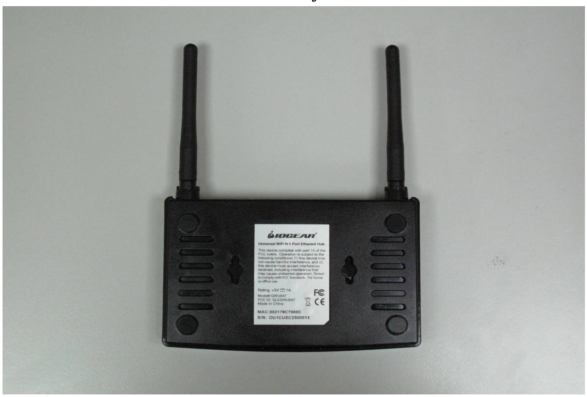
Side View of EUT - 1