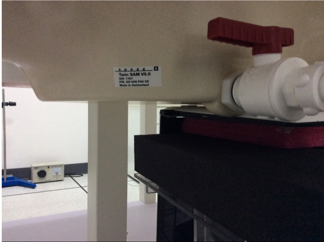
Horizontal-Up with gap 5mm