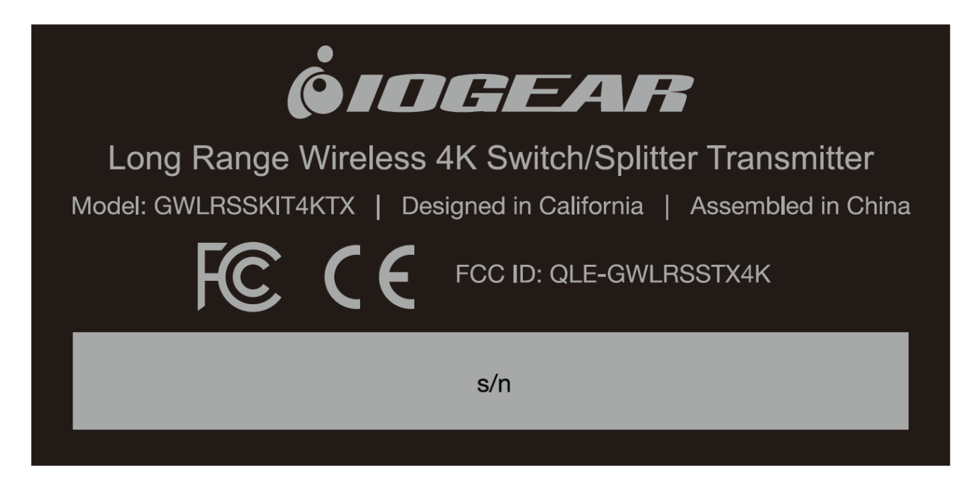
FCC ID Label Location Information