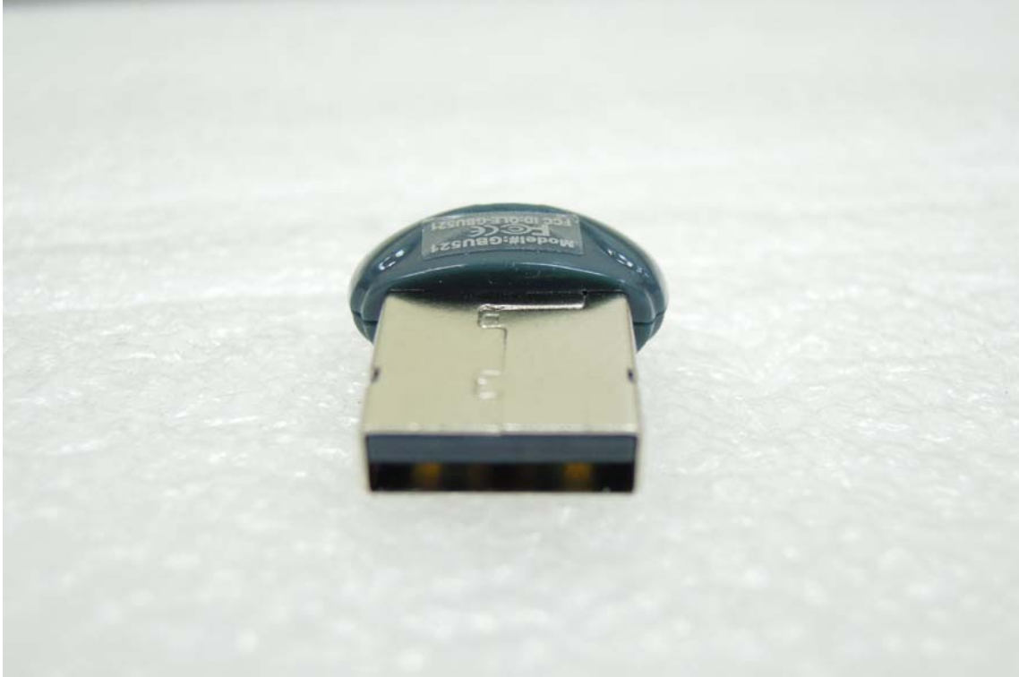
Side View of EUT-4