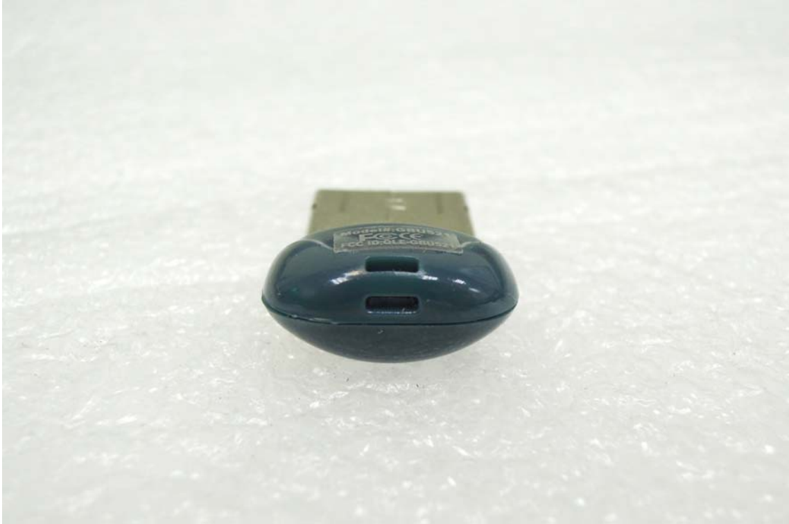
Side View of EUT-2