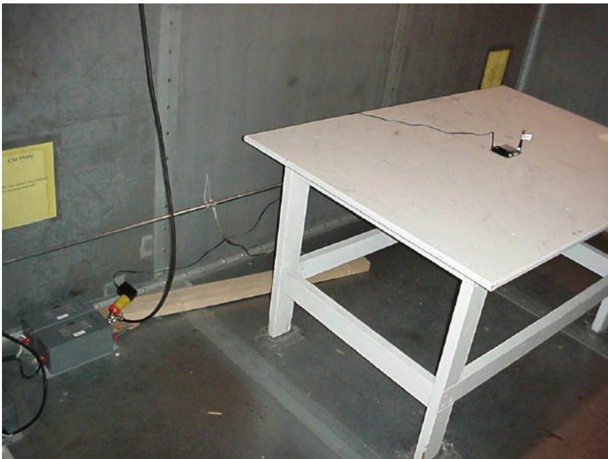
Photograph Shows Worst Case Configuration