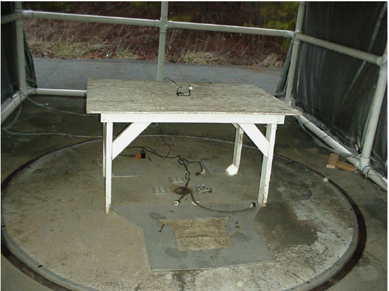
Photograph Shows Worst Case Configuration