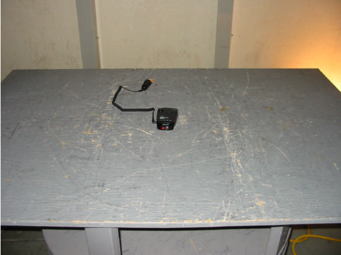
Model: Express 916