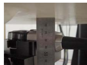
Figure 11. Mouth Face