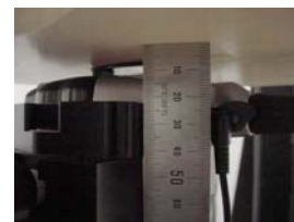
Figure 12. Body SAR