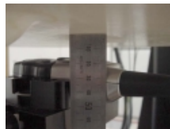
Figure 11. Mouth Face SAR Test Setup