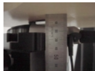
Figure 12. Body SAR Test Setup