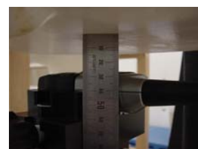
Figure 11. Mouth Face