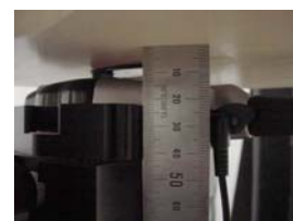
Figure 12. Body SAR