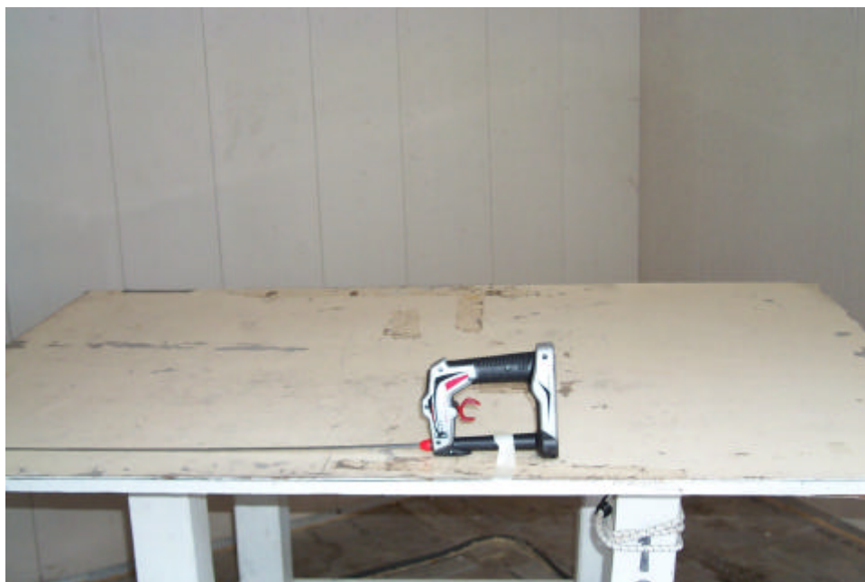
Figure 3.2 Radiated Test Setup, Position 2-Y