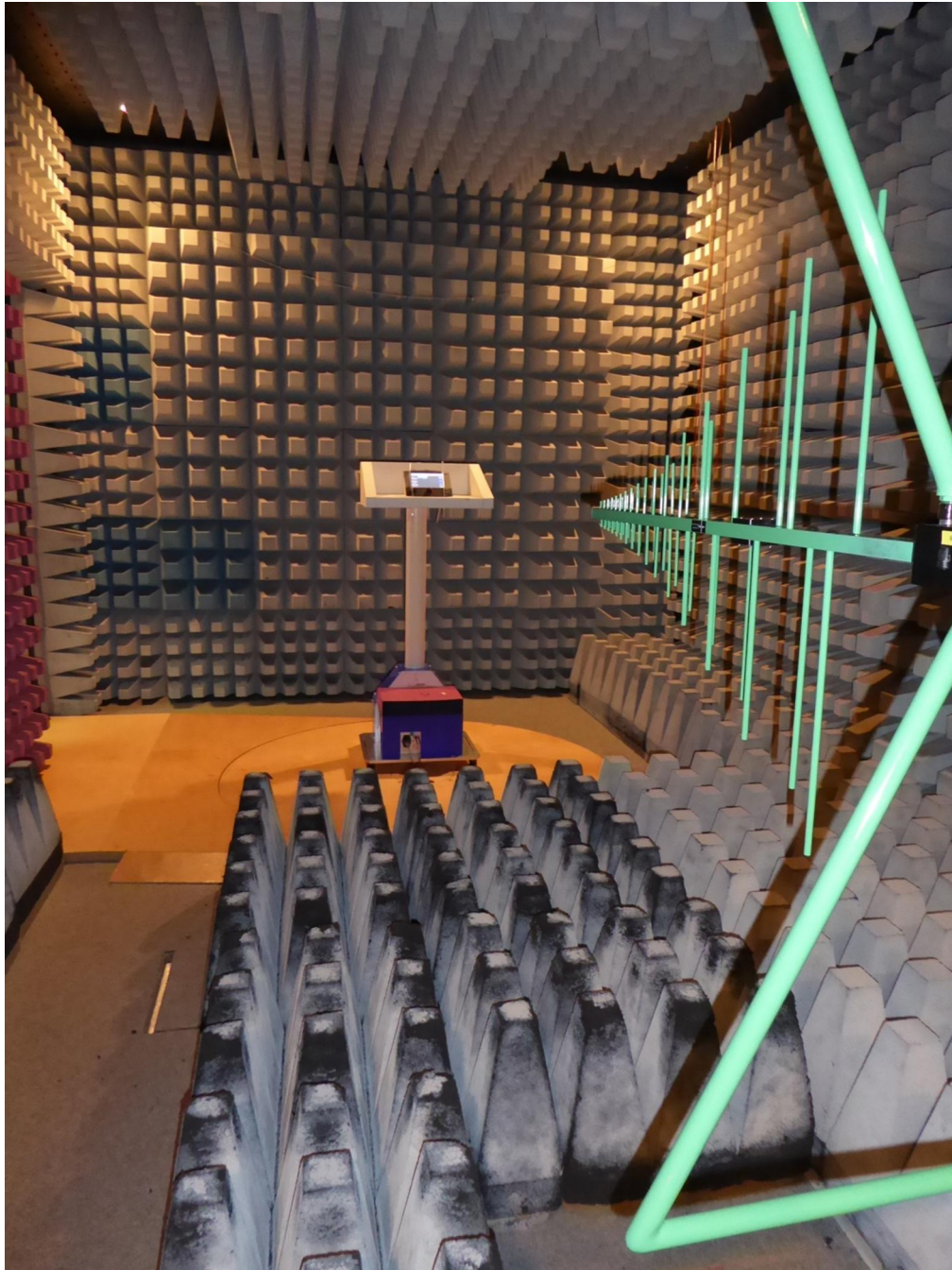
Preliminary Measurement FAR 30 MHz – 1 GHz