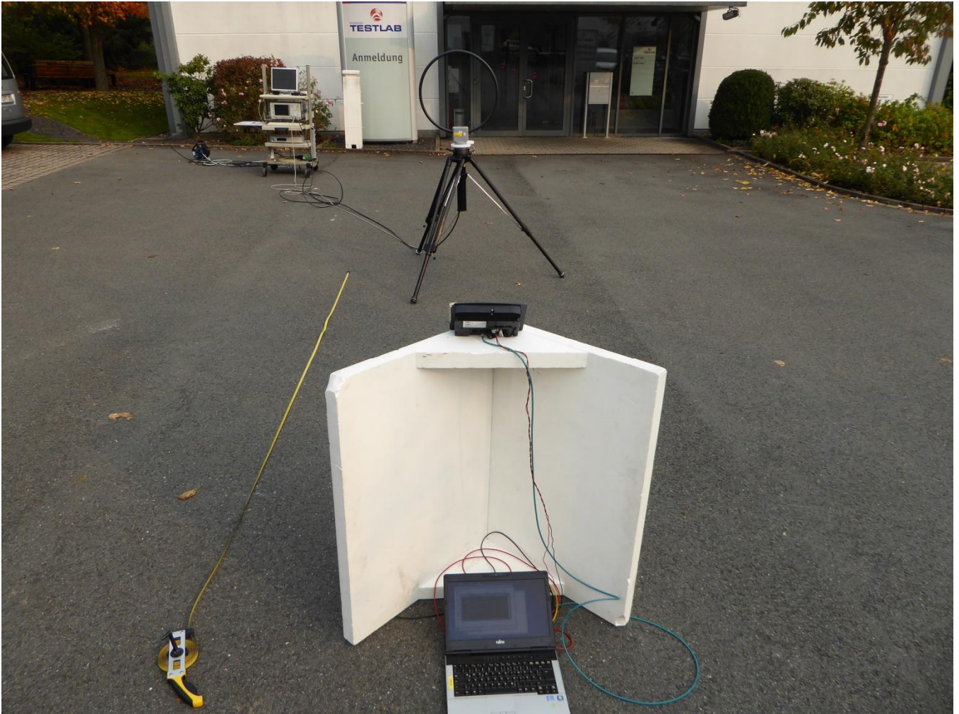
Final Measurement OATS 9 kHz – 30 MHz