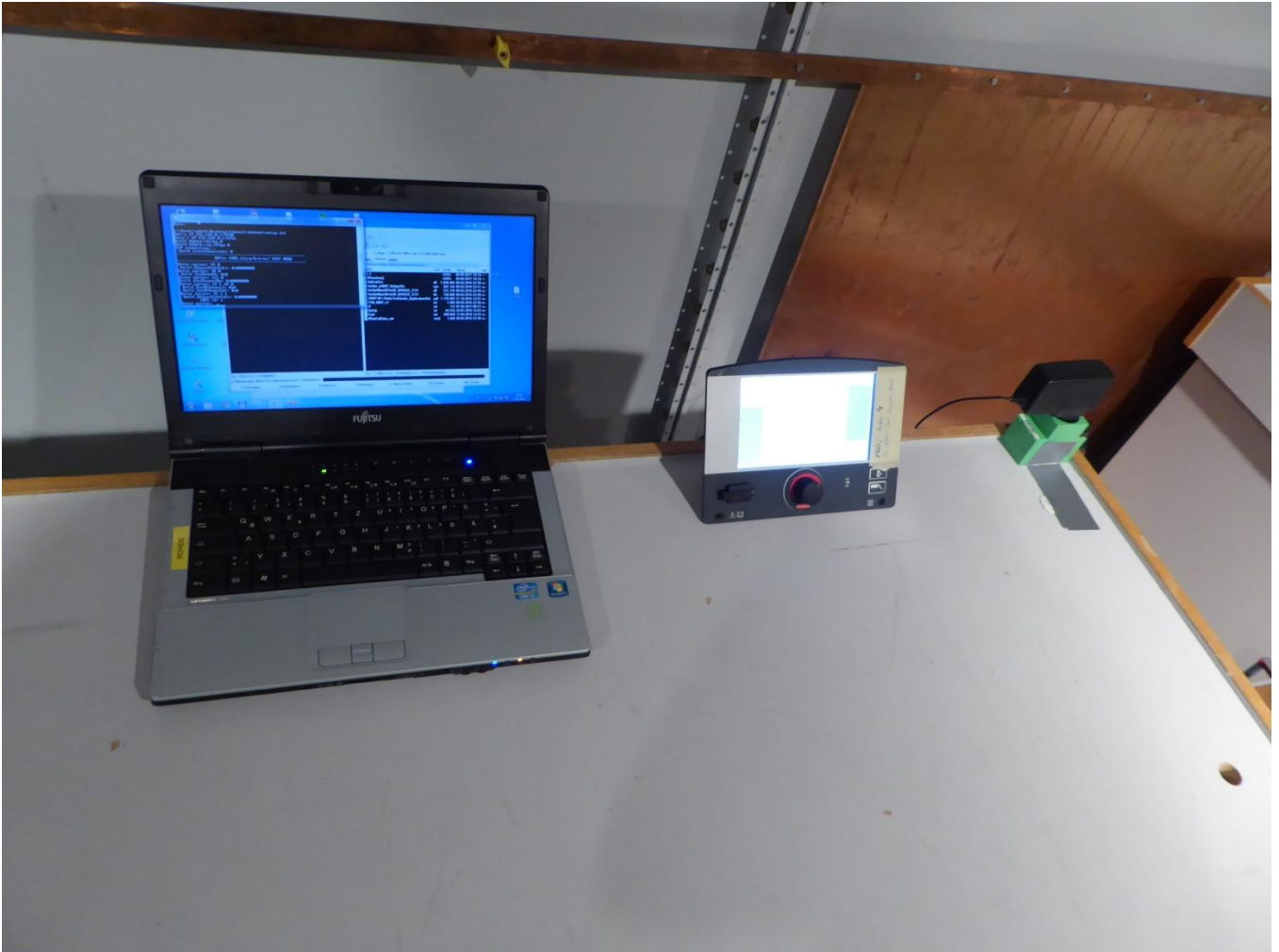
Conducted measurement on AC mains