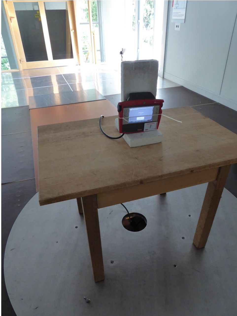
161548_4.JPG: Test setup open area test site