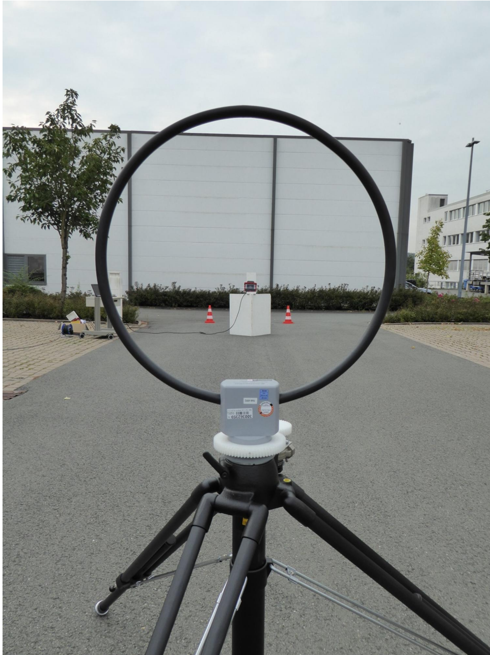
161548_3.JPG: Test setup outdoor testsite