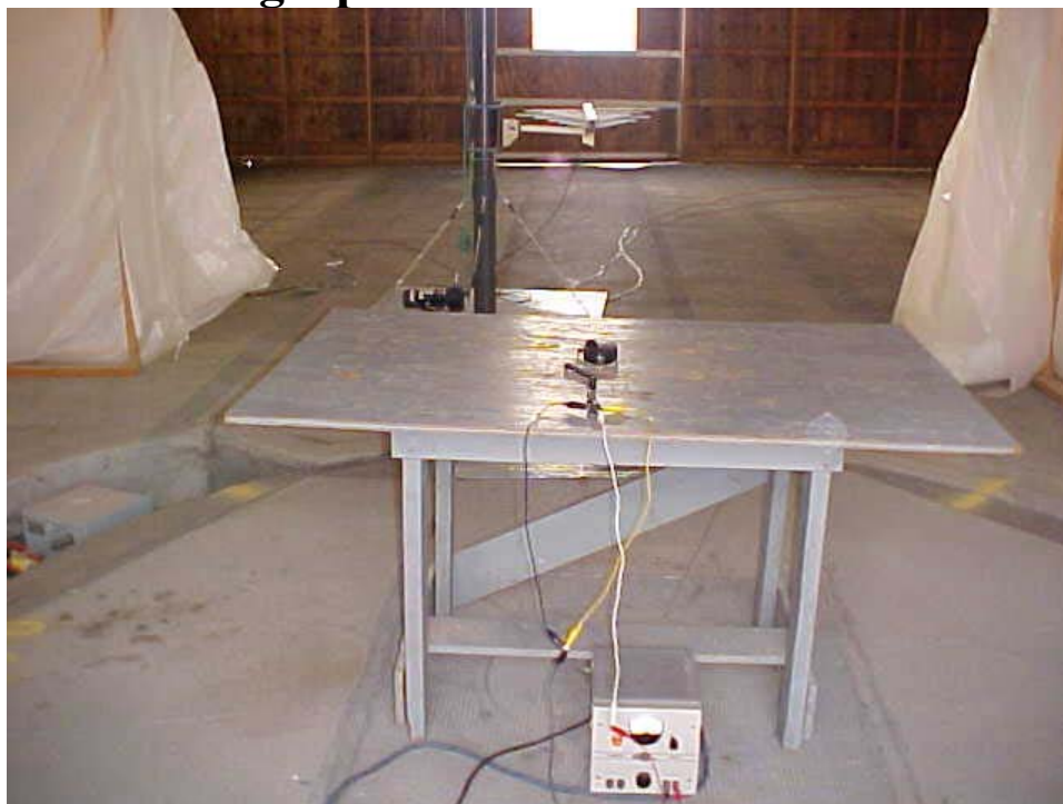
Photograph #2: Radiated Emissions

This report shall not be reproduced, except in full, without the written approval of DTT, Inc. And must not be used to claim product endorsement by NVLAP or any agency of the U.S. Government.