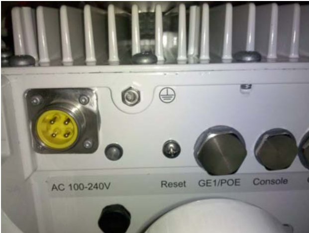
Figure 2 - Ground Label and Port Label