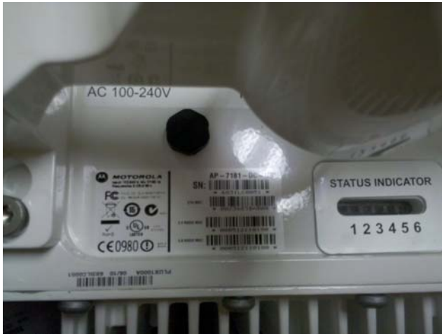
Figure 3 - Status Indicator Label and Unit Label