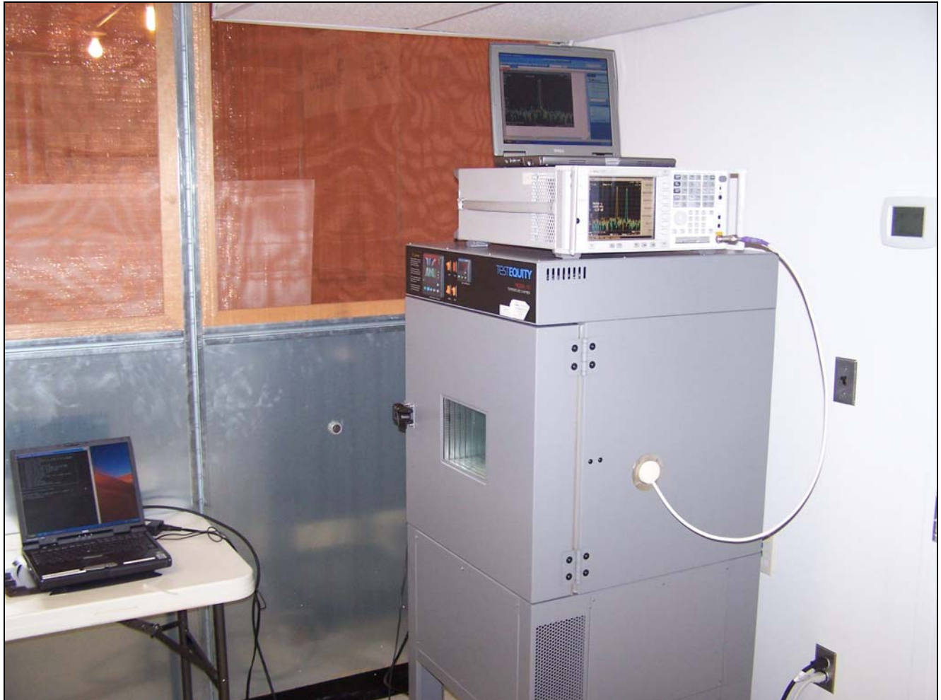
Photograph 4. Temperature Stability Test Setup