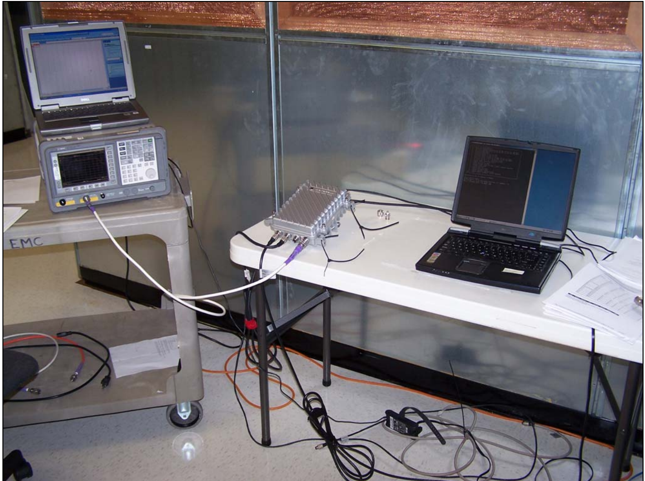
Photograph 3. Peak Power Spectral Density, Test Setup

Motorola Inc. Motorola, Inc., MOTOMESH Duo 4300-58 (2.4/5.8 GHz 802.11)