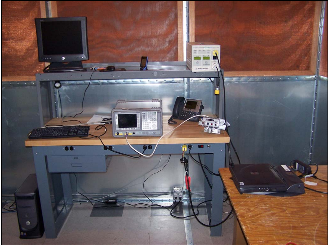
Photograph 5. Voltage Stability Test Setup

Motorola Inc. Motorola, Inc., MOTOMESH Duo 4300-58 (2.4/5.8 GHz 802.11)