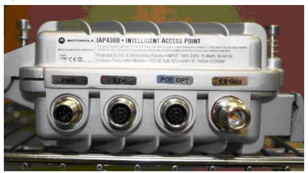
Figure 2-6 Close Up of External Connection Points