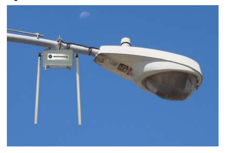
Figure 1-1 MWR4300 Device

This guide will provide you with technical specifications, installation guidelines, and testing procedures for the MOTOMESH Duo 4300 infrastructure devices.