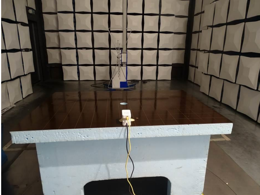
Radiated Disturbance (30MHz-1GHz)