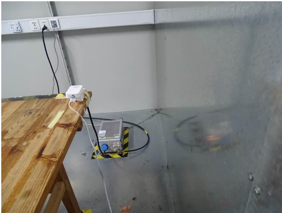
Conducted Emissions for AC Ports