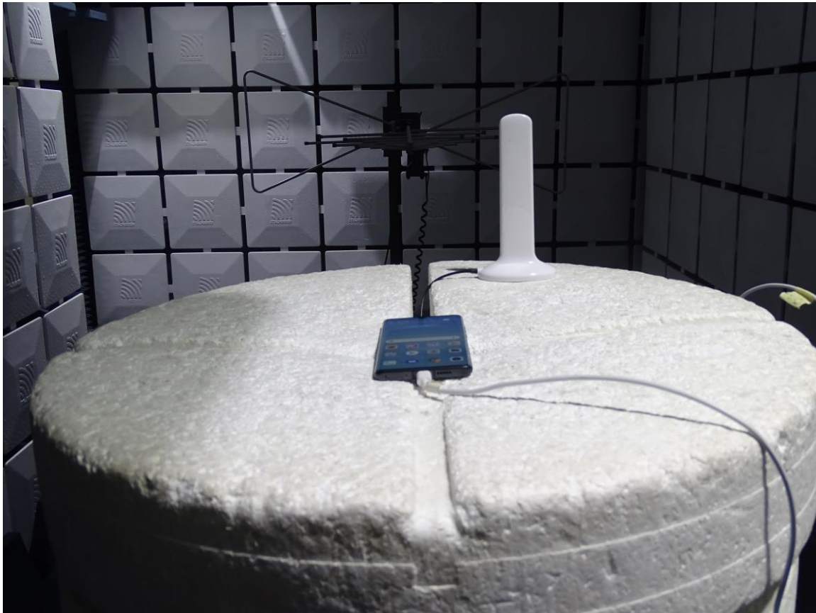
Radiated Spurious Emission (30MHz to 3GHz)