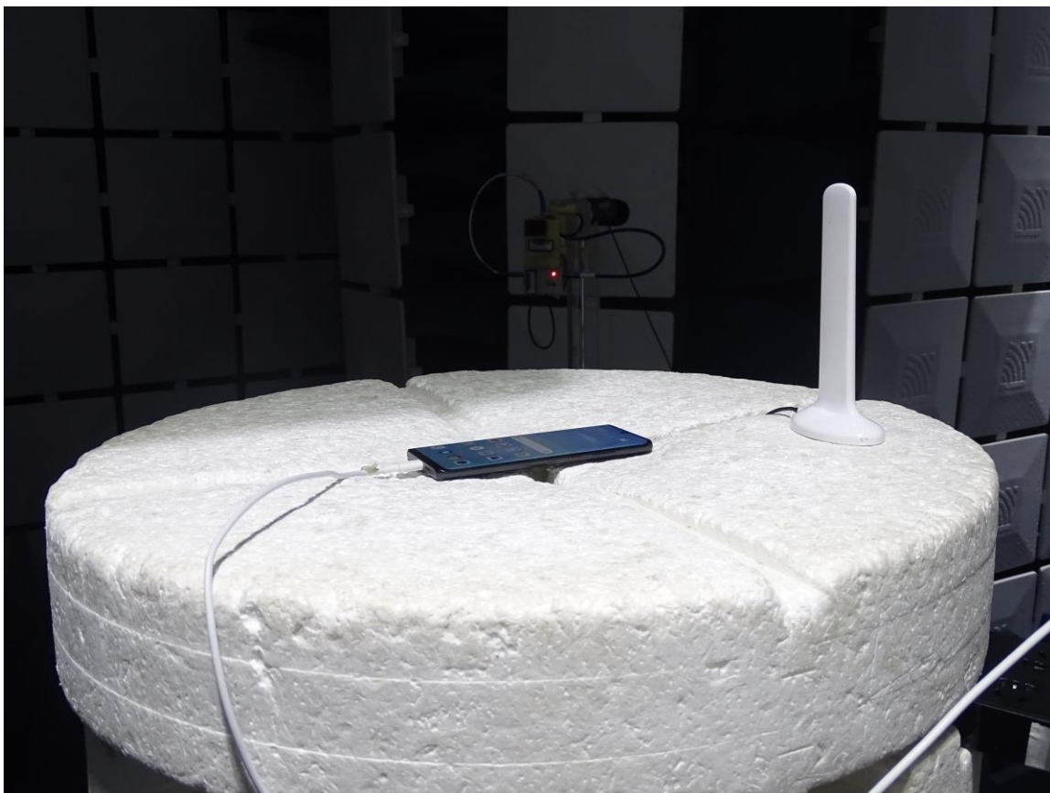
Radiated Spurious Emission (18GHz to26.5GHz)