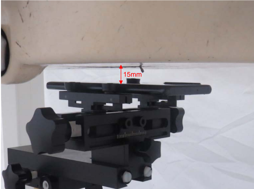
Picture 5: Back Side, the distance from handset to the bottom of the Phantom is 15mm