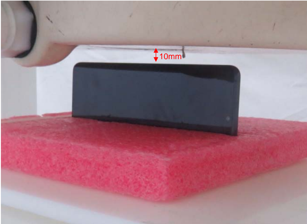
Picture 9: Left Side, the distance from handset to the bottom of the Phantom is 10mm