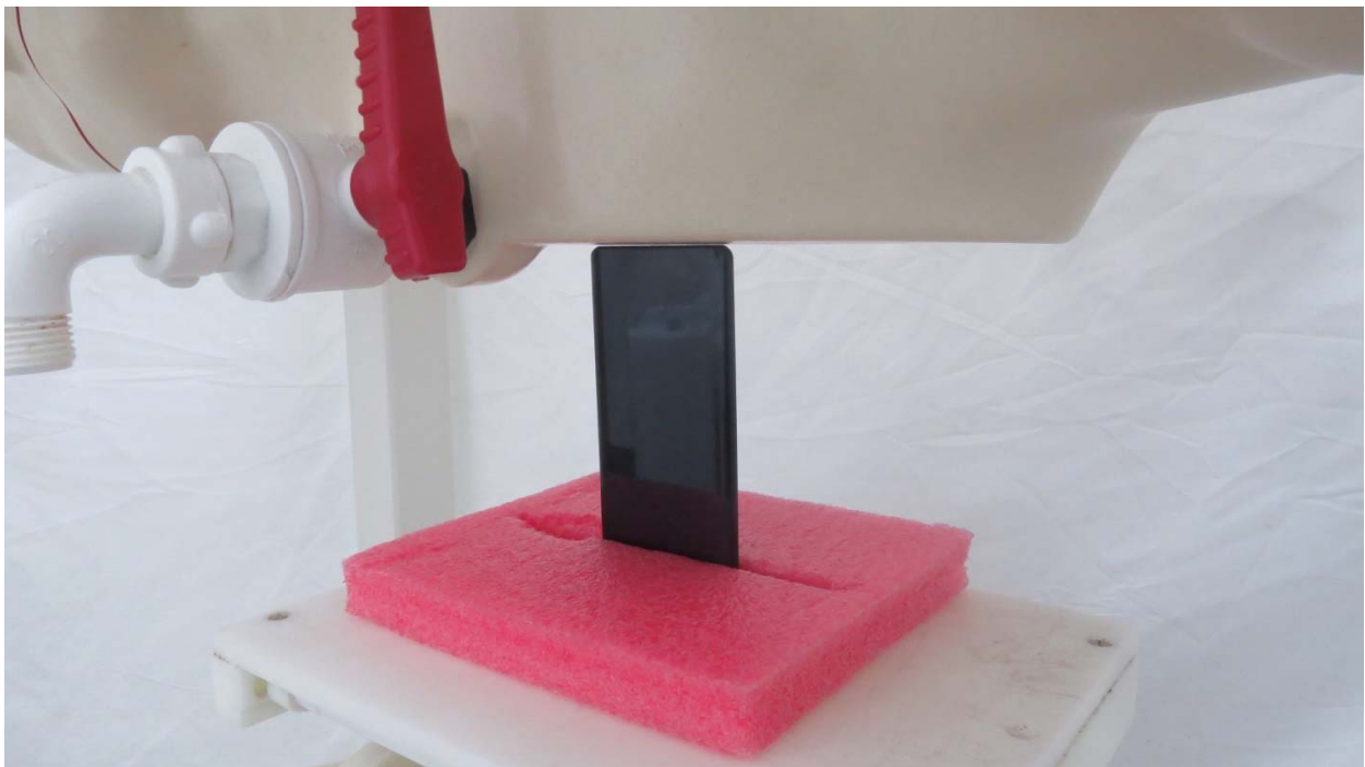
Picture 18: Bottom Edge, the distance from handset to the bottom of the Phantom is 0mm