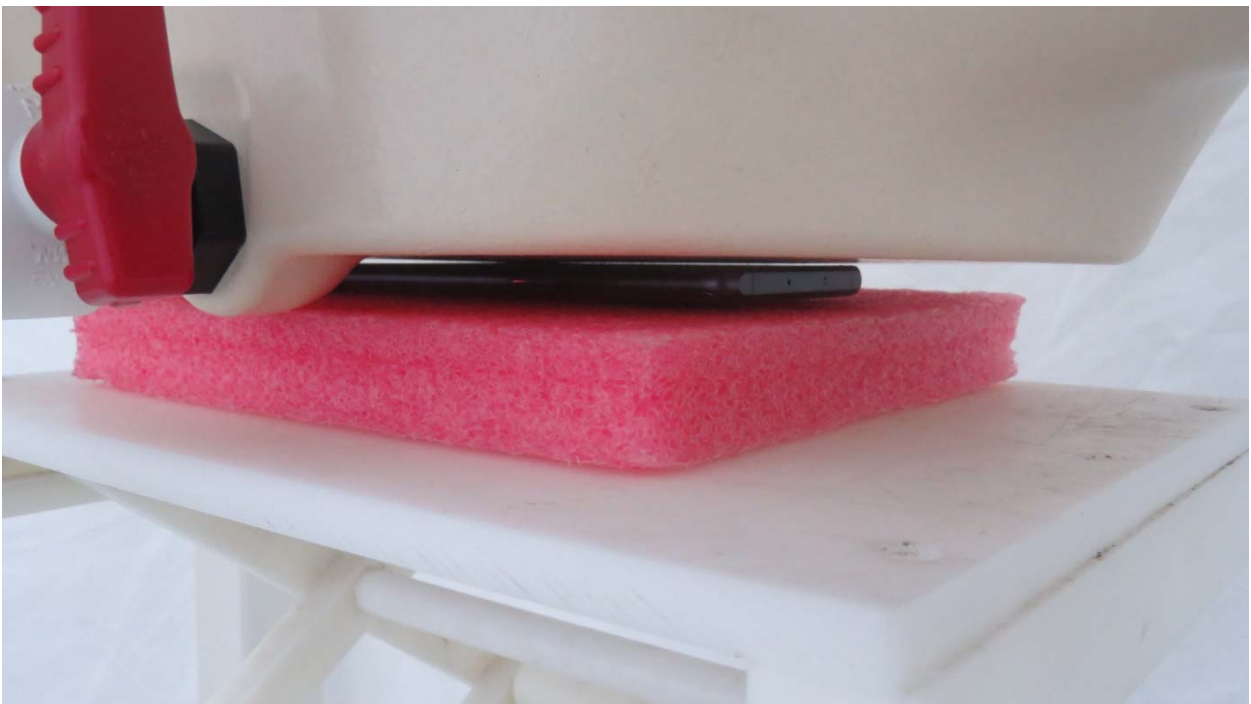
Picture 14: Front Side, the distance from handset to the bottom of the Phantom is 0mm