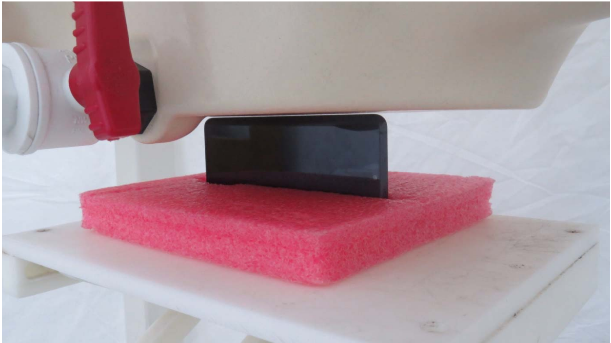
Picture 15: Left Side, the distance from handset to the bottom of the Phantom is 0mm