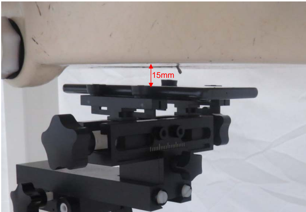
Picture 6: Front Side, the distance from handset to the bottom of the Phantom is 15mm