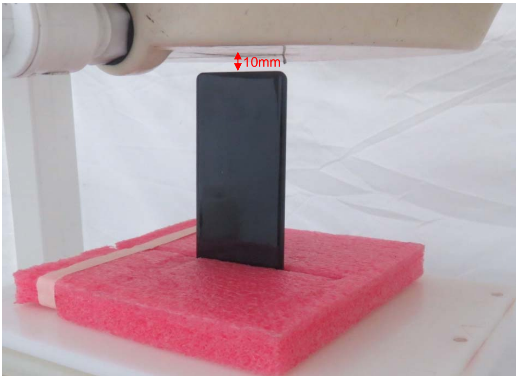
Picture 12: Bottom Edge, the distance from handset to the bottom of the Phantom is 10mm