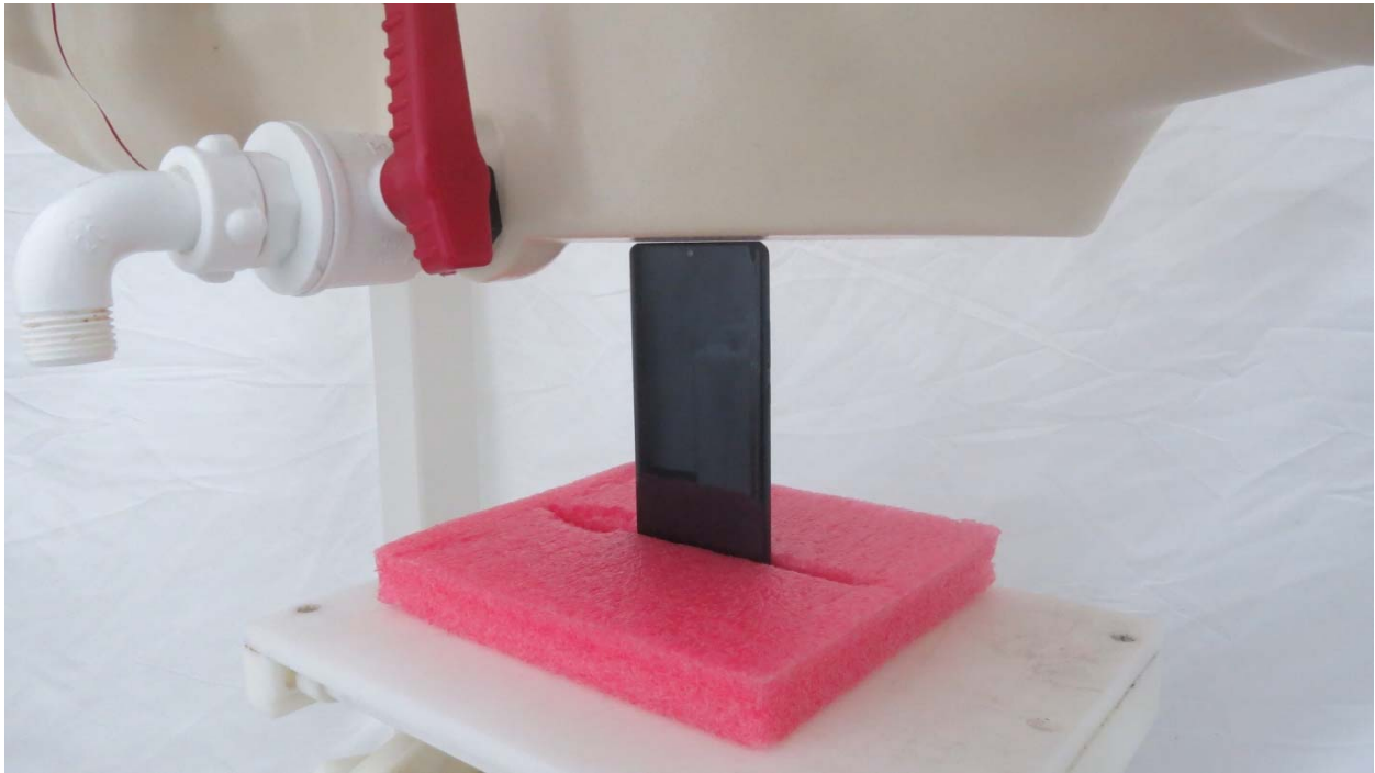
Picture 17: Top Side, the distance from handset to the bottom of the Phantom is 0mm