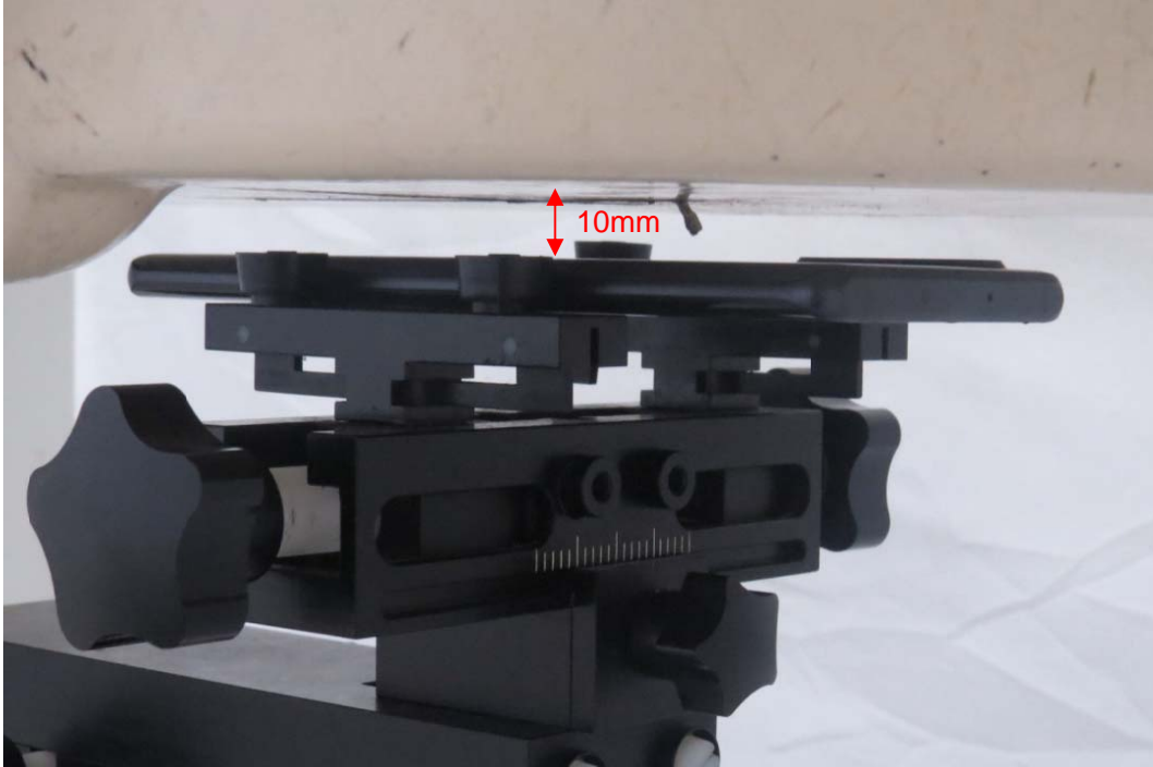
Picture 7: Back Side, the distance from handset to the bottom of the Phantom is 10mm