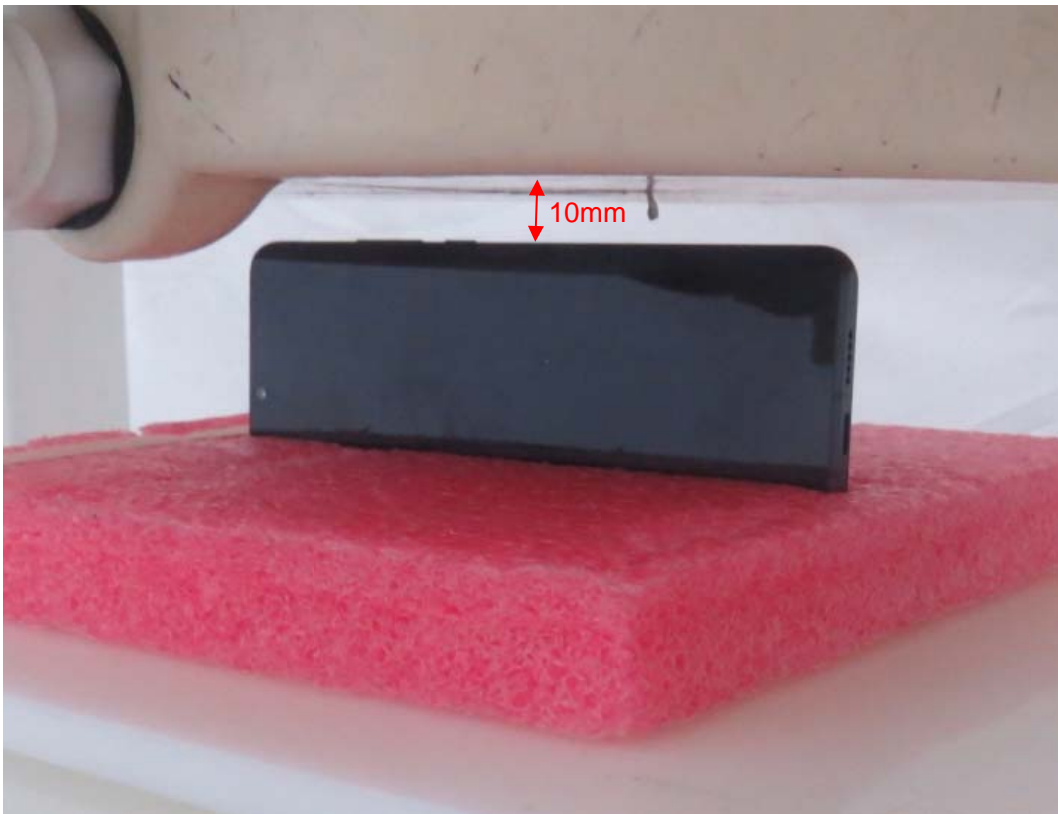
Picture 10: Right Side, the distance from handset to the bottom of the Phantom is 10mm