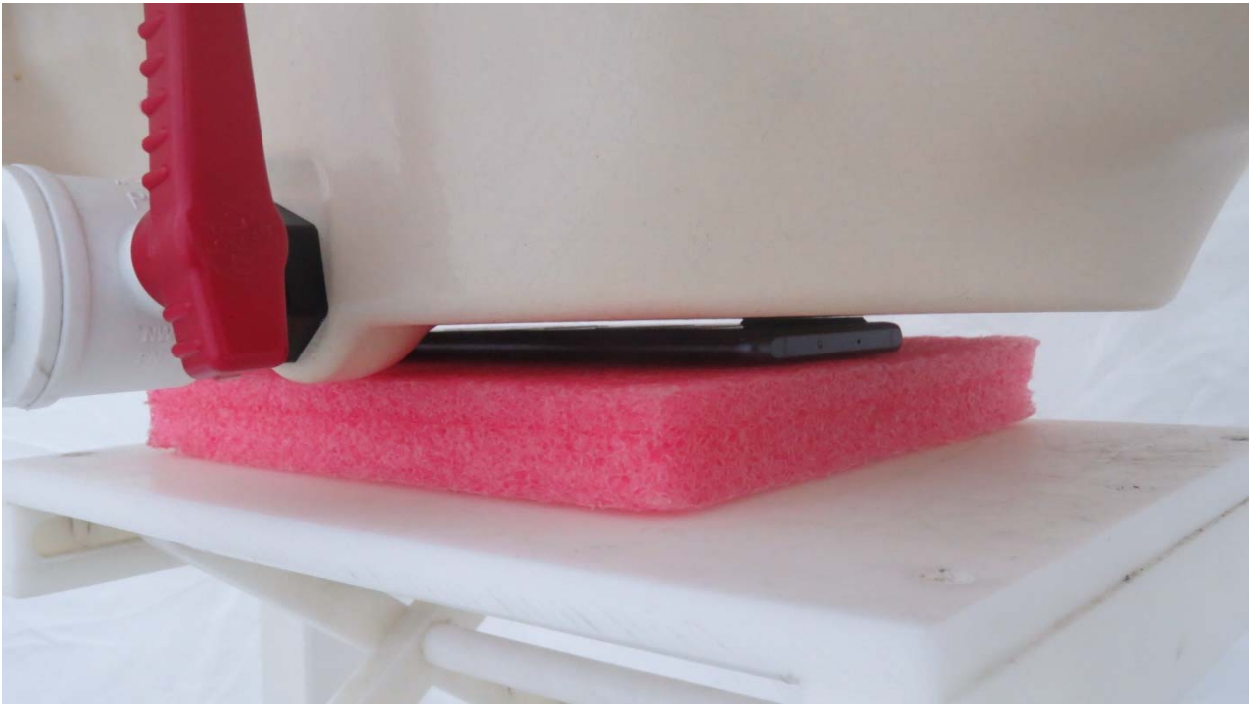
Picture 13: Back Side, the distance from handset to the bottom of the Phantom is 0mm