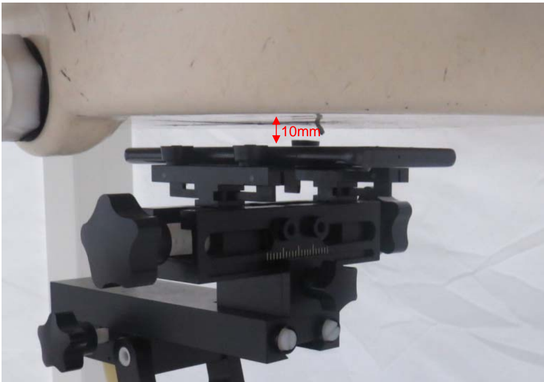
Picture 8: Front Side, the distance from handset to the bottom of the Phantom is 10mm