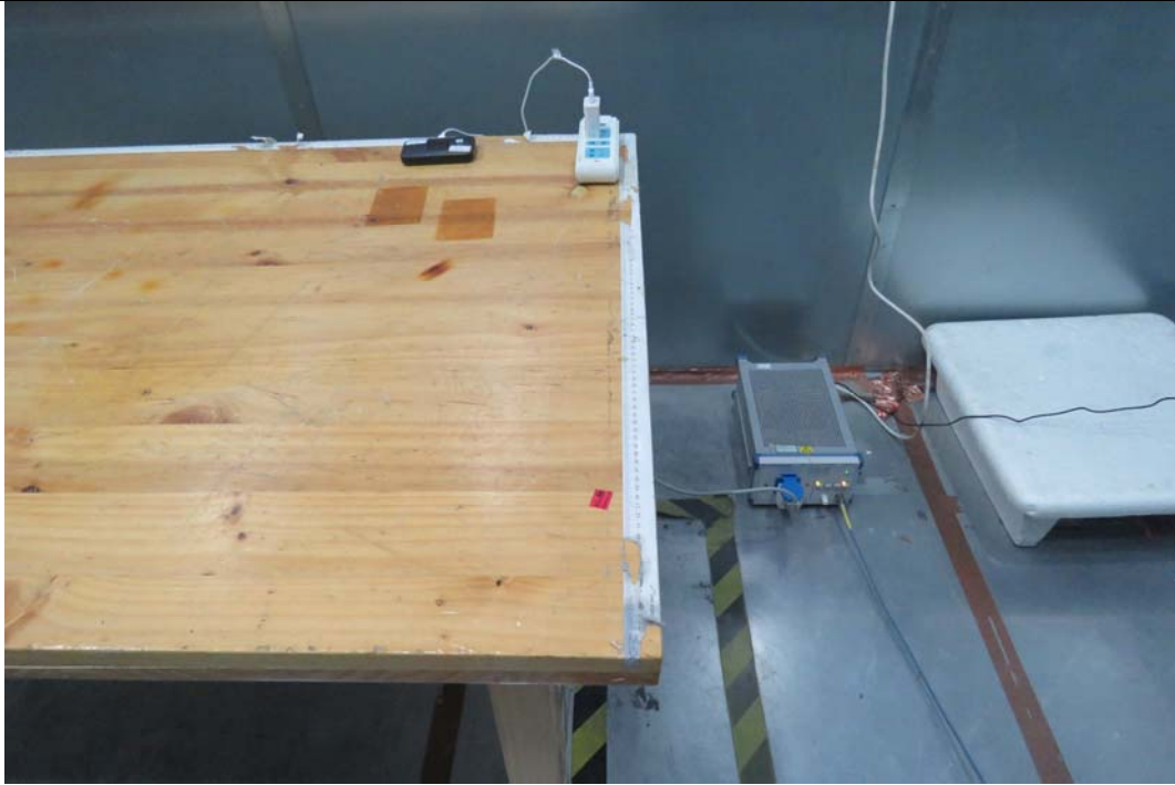
Picture 3 Conducted Emission Test Setup