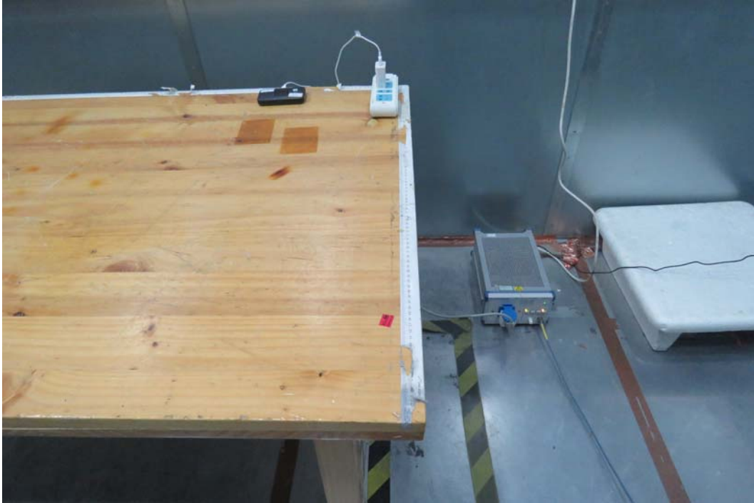
Picture 3 Conducted Emission Test Setup