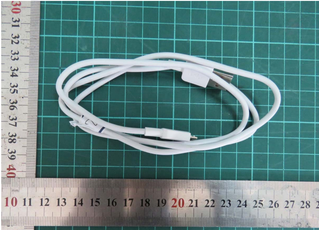
b: USB Cable