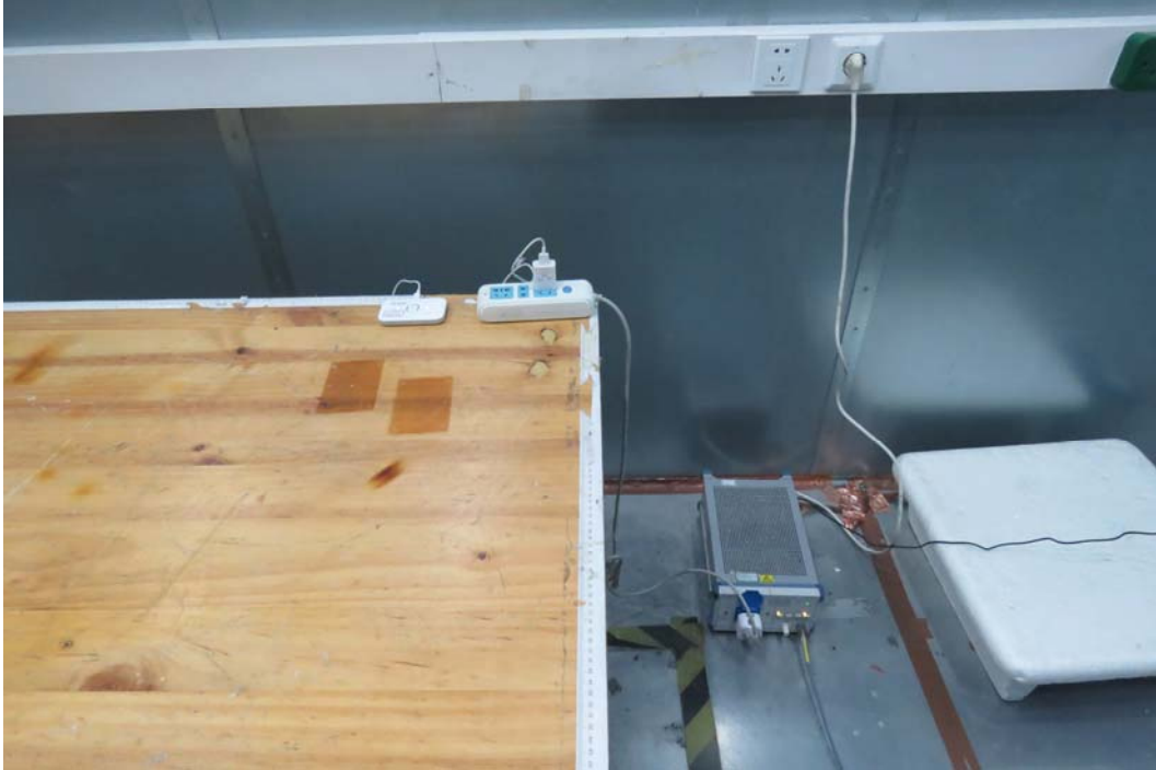
Picture 3 Conducted Emission Test Setup