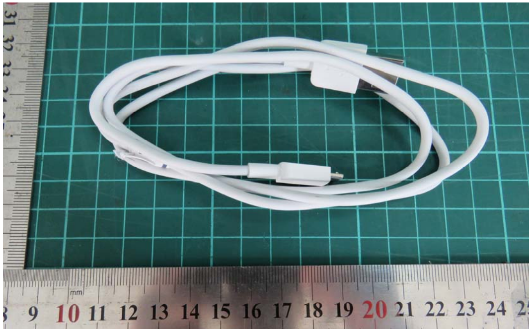
d: USB Cable