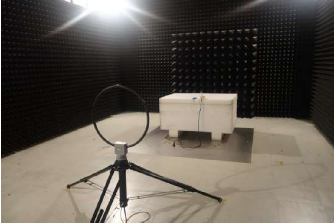
Radiated Spurious Emission (9K-30MHz)