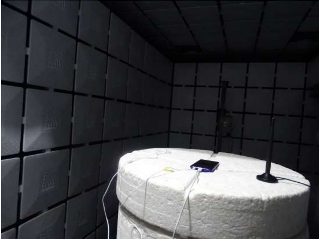
Radiated Spurious Emission (3GHz to18GHz)