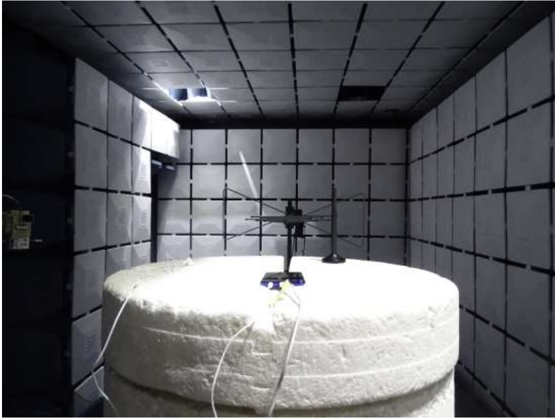
Radiated Spurious Emission (30MHz to 3GHz)