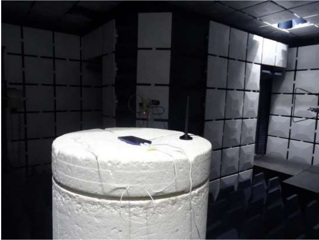
Radiated Spurious Emission (18GHz to26.5GHz)