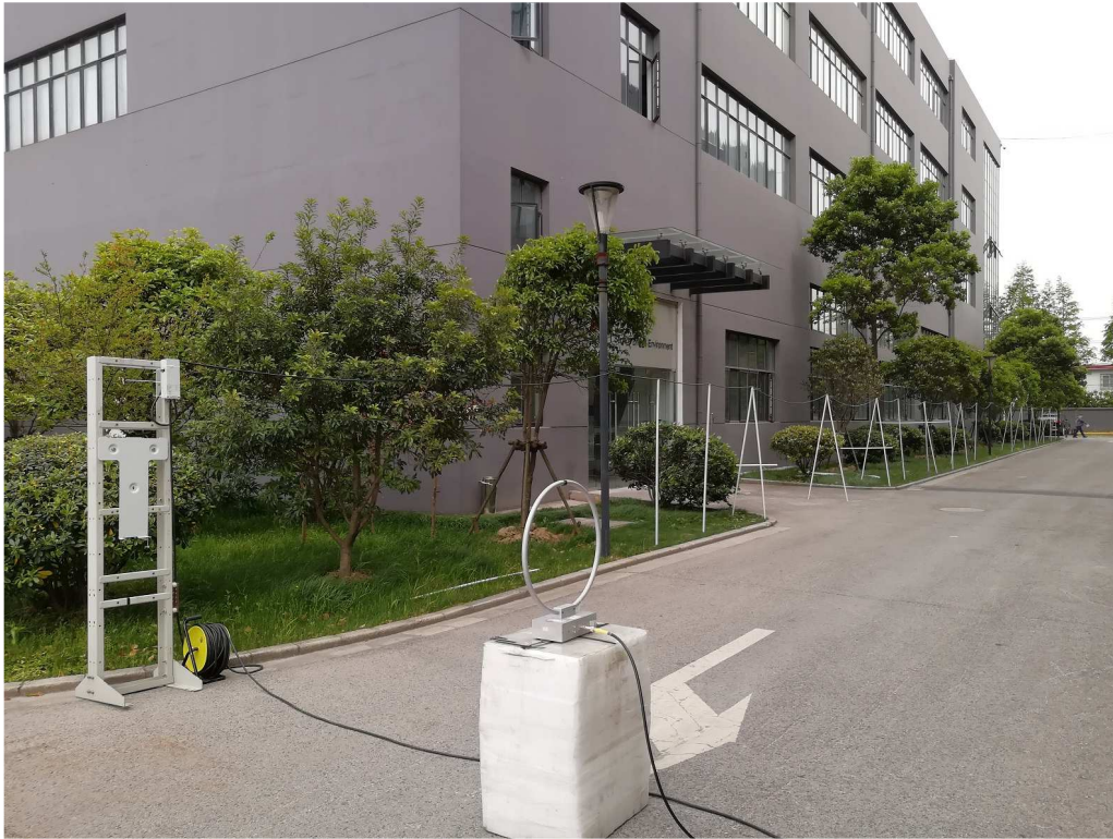
Overhead, Location 2, lower than 30MHz