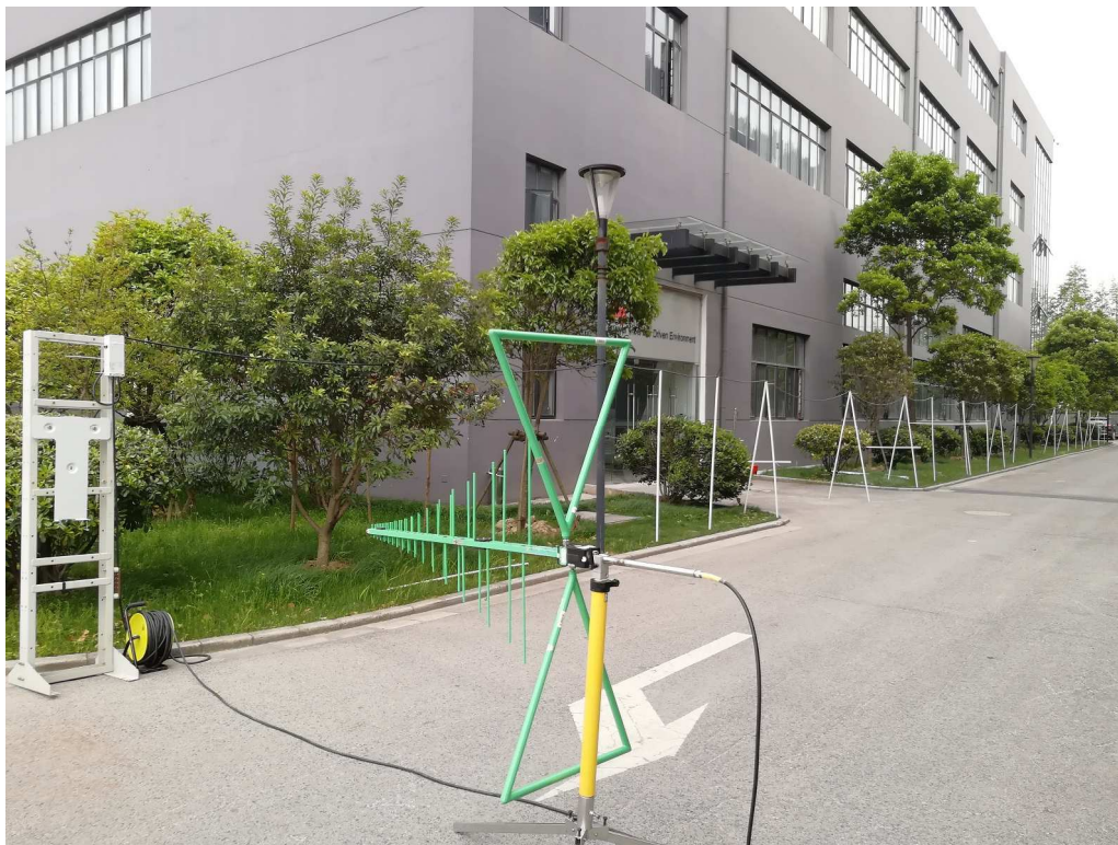
Overhead, Location 2, higher than 30MHz