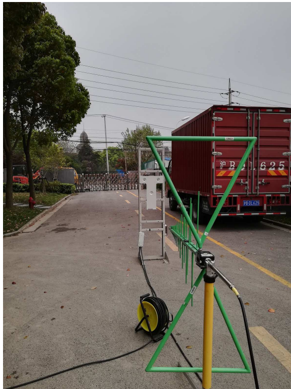
Underground, Location 1, higher than 30MHz