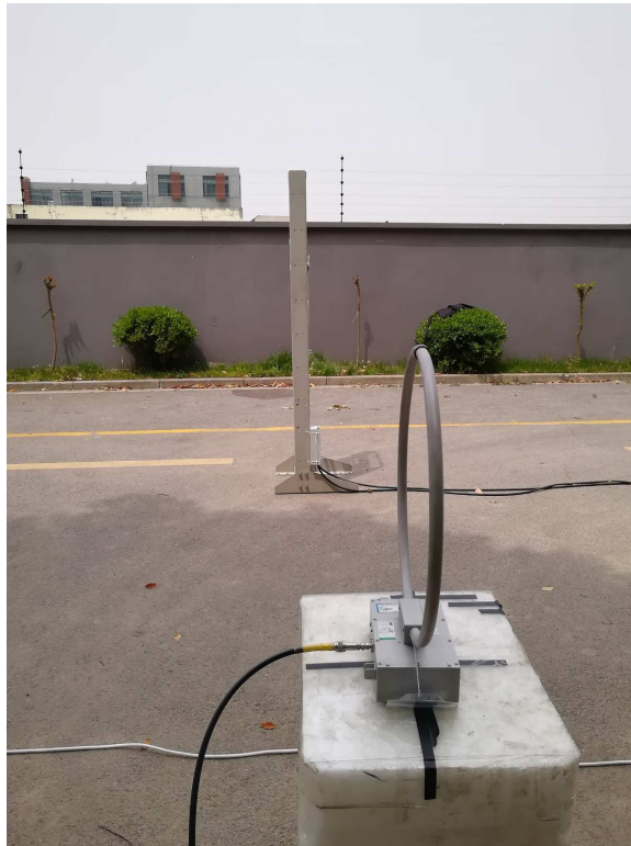
Underground, Location 1, lower than 30MHz