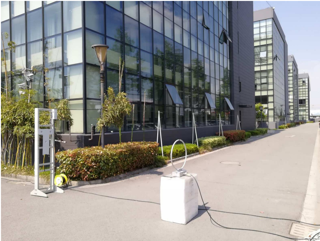
Overhead, Location 3, lower than 30MHz