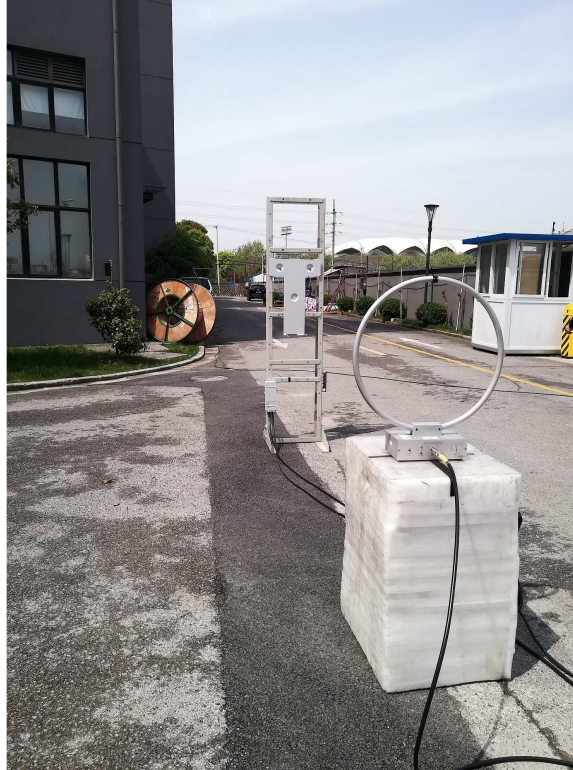
Underground, Location 2, lower than 30MHz