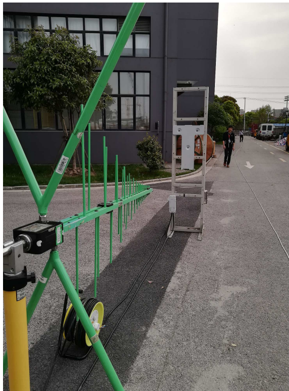
Underground, Location 2, higher than 30MHz