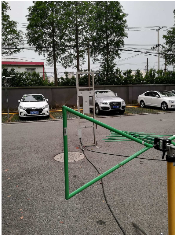
Underground, Location 3, higher than 30MHz