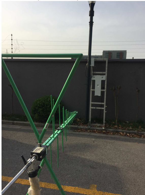
Overhead, Location 1, higher than 30MHz