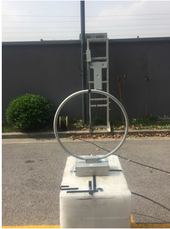
Overhead, Location 1, lower than 30MHz