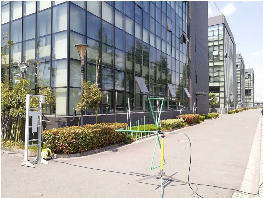
Overhead, Location 3, higher than 30MHz